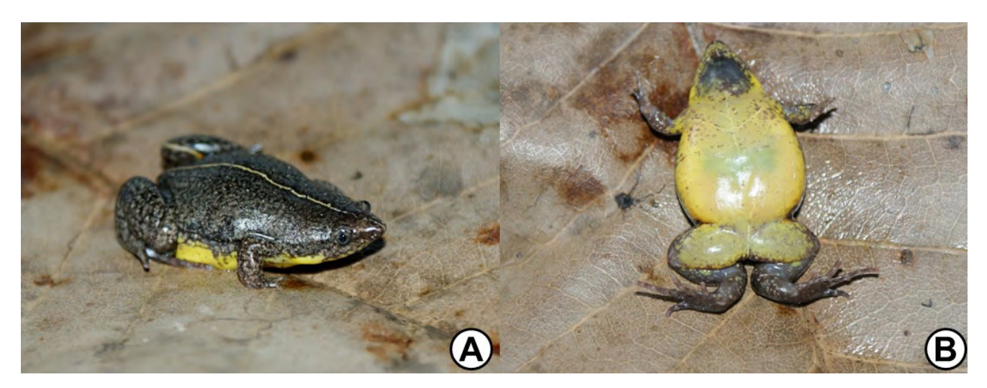
Figure 1. Elachistocleis helianneae from municipality of Macapá, state of Amapá, Brazil: (A) dorsolateral and (B) ventral color pattern of a live adult specimen (male; SVL 27.2 mm) collected in May 2013 at Experimental Field of the Brazilian Agricultural Research Corporation/EMBRAPA, in Amazon savanna.

Eleven species occur in Brazil: Elachistocleis bicolor (Valenciennes in Guérin-Menéville, 1838); E. bumbameuboi Carmaschi, 2010; E. carvalhoi Carmaschi, 2010; E. cesarii (Miranda Ribeiro (1920); E. helianneae Carmaschi, 2010; E. erythrogaster Kwet & Di-Bernardo, 1998; E.