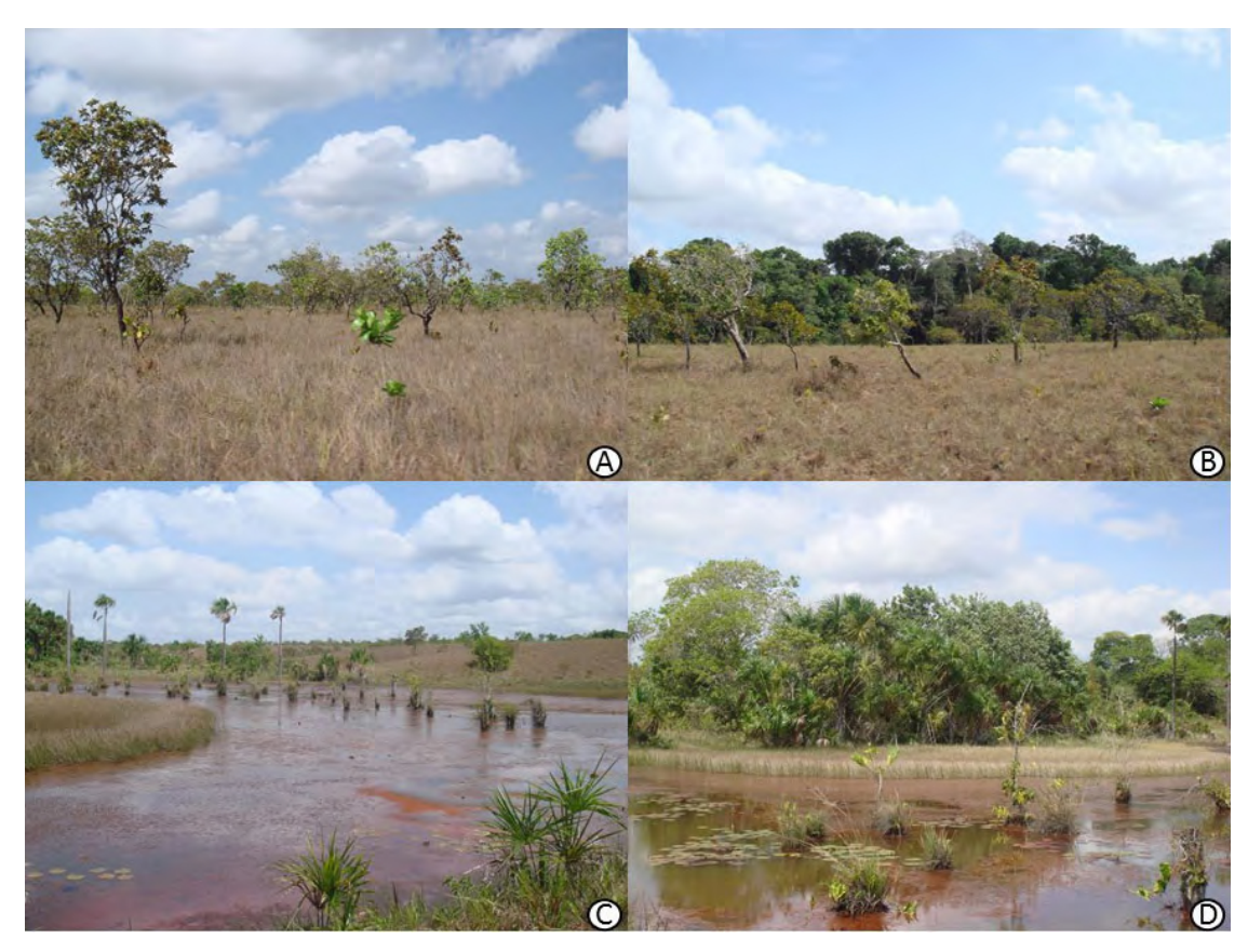
Figure 2. Breeding habitats of Elachistocleis helianneae : (A) scrub grassland savanna; (B) parkland savanna; (C) and (D) permanent ponds in Amazon savanna.

magnus Toledo, 2010; E. matogrosso Carmaschi, 2010; E. muiraquitan Nunes-de-Almeida & Toledo, 2012; E. piauiensis Caramaschi & Jim, 1983 and E. surumu Carmaschi, 2010. Elachistocleis helianneae differs from all other congenerics mainly by its small size (snout vent length 28.7 mm in males and 36.4 mm in females) and head length slightly smaller than the head width. All individuals present a post-commisural gland poorly developed, and grayish brown dorsum with minute light spots on dorsum and dorsal surfaces of members and ventral coloration immaculate cream (Figure 1). Also E . helianneae is different of the other species in the genus by the distinctive mid-dorsal longitudinal light cream stripe, from the tip of snout to vent and by the sharp color limit between the dorsal and ventral regions and by the stripe on the posterior surface of thighs broad, irregular (Caramaschi 2010).