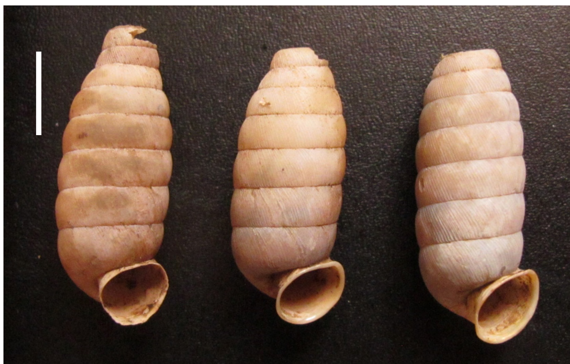
Figure 3. Some specimens of Anisospira (Trachycion) velascorum . From left to right: UCMR 0022, 0023, and 0024. Scale bar = 10 mm.

Given that the known geographic range of A. velascorum at present only comprises two localities, its