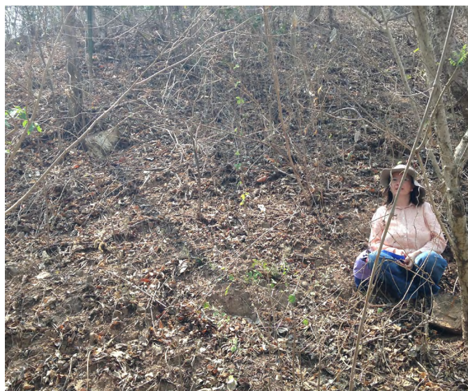
Figure 2. A general view of where the specimens were sampled in the Chepilme Botanical Garden.

the shells were empty and the species is not endangered or vulnerable status in the list of threatened species, a permit was not required; this was verified with X. Isidro, Inspector General de Vida Silvestre in Federal Attorney for Environmental Protection (PROFEPA).