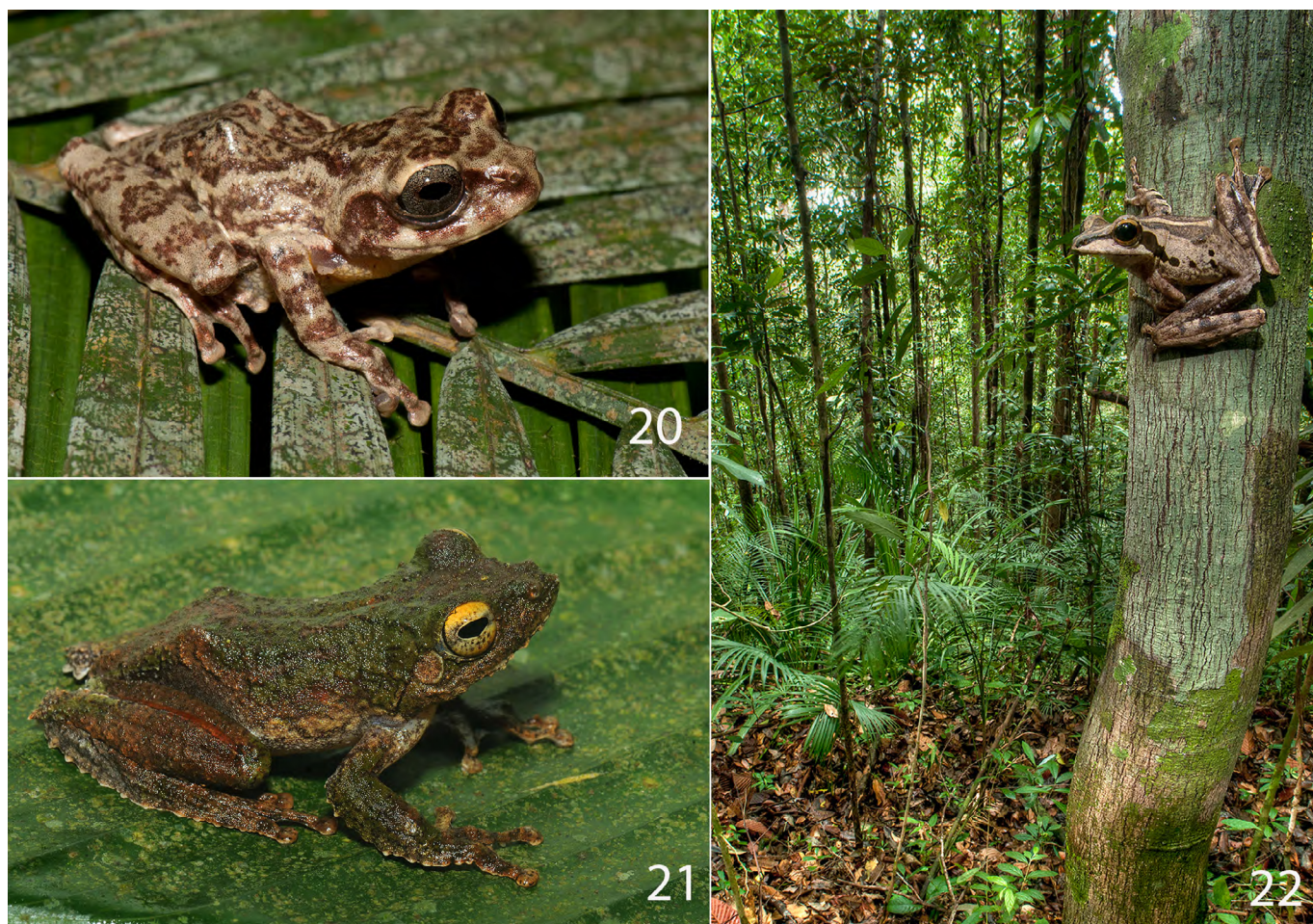
Figures 20–22. Frogs collected from Gunung Tebu and Lata Tembaka. 20: Philautus vermiculatus from Gunung Tebu. 21: Kurixalus appendiculatus from Lata Tembaka. 22: Polypedates macrotis from Gunung Tebu.

and chest and belly whitish and usually without spots.