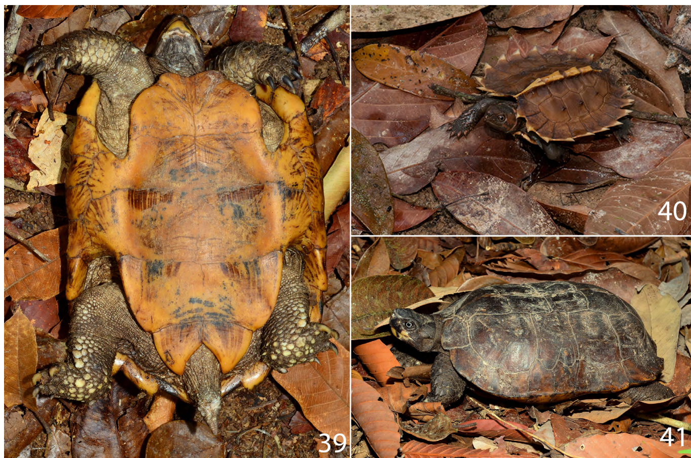
Figures 39–41. Heosemys spinosa from Lata Belatan. 39: Plastron. 40: Juvenile. 41: Adult.

blotches on its sides in its anterior part, becoming posteriorly nearly completely rusty brown with darker hues and white whereas specimens from central West Malaysia have the tail green laterally, rusty dark brown or dark above, with a sharp border between green and brown areas. The Gunung Tebu specimen may be a new species (Quah in prep).