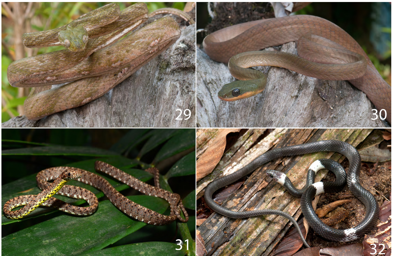
Figures 29–32. Snakes from Gunung Tebu and Lata Belatan. 29: Boiga drapiezii from Gunung Tebu. 30: Boiga nigriceps from Gunung Tebu. 31: Boiga jaspidea from Lata Belatan. 32: Lycodon subsinictus from Lata Belatan.

An adult male (SVL 1850 mm) matches with Tweedie's (1983) diagnosis of this species and Grismer's (2011) diagnosis of specimens from Pulau Tioman in having a long, laterally compressed body, sharp vertebral ridge, and a greatly enlarged blunt, triangular head; head scales large and plate-like; eyes protuberant; pupils vertical; 19 rows of smooth, dorsal scale rows at mid-body with an enlarged vertebral row; 250–285 ventrals; 114–168 divided subcaudals; and anal plate entire. Color pattern variation in this species is extensive (Tweedie 1983), but it is not known how it correlates with geography. LSUHC 11232 has a greenish-grey body with ill-defined, dark-centered, lateral blotches with the darker areas between them being obscurely pale-centered (Tweedie 1983) whereas specimens from Pulau Tioman and Pulau Tinggi are more reddish (Grismer 2011a). LSUHC 10837 from Lata Belatan was also reddish in color. LSUHC 10884 was lost in transit.