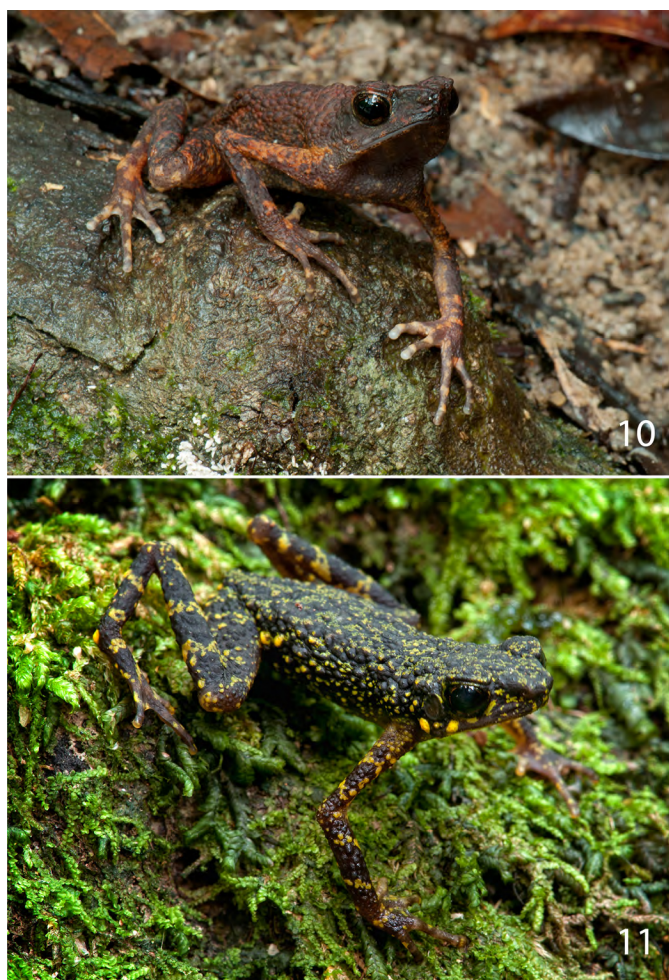
Figures 10 and 11. Recently described Ansonia species. 10: Ansonia latifii from Hutan Lipur Lata Tembaka. 11: Ansonia lumut from Punca Air, Gunung Tebu.