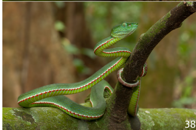
Figures 37 and 38: Snakes from Lata Tembaka and Gunung Tebu. 37: Paras hageni from Lata Tembaka. 38: Popeia fucata from Gunung Tebu.

having a green body with two rows of pinkish spots and a white line along the lowest dorsals bordered below with black; supraocular scales broad, separated by 4–9 scales; 177–198 ventral scales; scales between the eyes bluntly keeled; head broad and flat; ventral scales differentiated; and tail rounded in cross section. This specimen disagrees with Tweedie's (1983) diagnosis by having nasal scales not in contact.