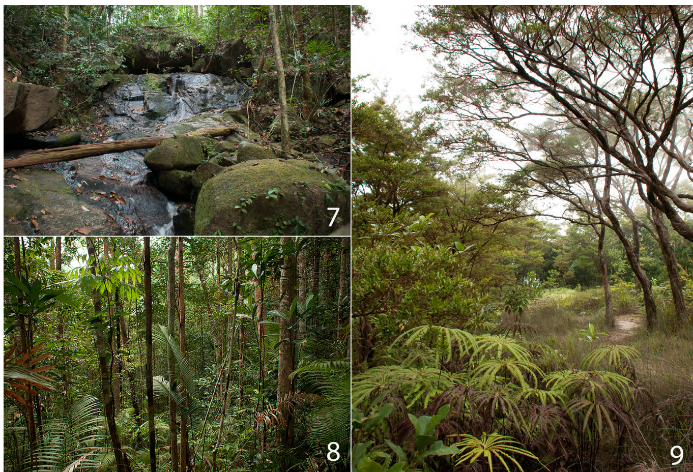
Figures 7–9. Gunung Tebu habitat. 7: Punca Air at 550 m, 8: Hill dipterocarp forest at 700 m, 9: Summit of Gunung Tebu.

LSUHC refers to La Sierra University Herpetological Collection; LSUDPC refers to La Sierra University Digital Photographic Collection; USMHC refers to Universiti Sains Malaysia Herpetological Collection. For taxonomies of the lizards we follow Grismer (2011a,b), amphibian taxonomy follows Frost (1985), and snake taxonomy follows Tweedie (1983).