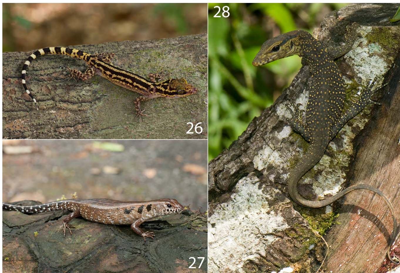
Figures 26–28: Lizards from Lata Belatan and Gunung Tebu. 26: Cyrtodactylus tebuensis from Gunung Tebu. 27: Sphenomorphus praesignus from Gunung Tebu. 28: Varanus nebulosus from Lata Belatan.

Cyrtodactylus timur can be differentiated from all other species of Cyrtodactylus by having 10–12 supralabials; 8–10 infralabials; weak body tuberculation; no tubercles on ventral surface of forelimbs, gular region, or in ventrolateral body folds; 38–43 paravertebral tubercles; 21–24 longitudinal tubercle rows; 31–40 ventral scales; 21–25 subdigital lamellae on fourth toe; 21 or 22 femoroprecloacal pores; deep precloacal groove; four dark dorsal body bands; body band/interspace ratio 1.00–1.25; no scattered white tubercles on dorsum; 8–10 dark caudal bands on original tail; white caudal bands nearly immaculate; and a maximum SVL of 120.5 mm.