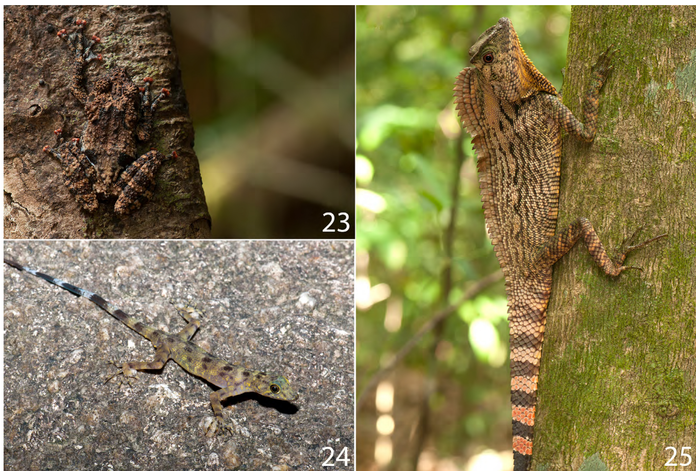
Figures 23–25: A frog and lizards from Gunung Tebu and Lata Belatan. 23: Theloderma horridum from Gunung Tebu. 24: Cnemaspis argus from Lata Belatan. 25: Gonocephalus abbotti from Gunung Tebu.

September 2012. LSUHC 11175, 30 June 2013.