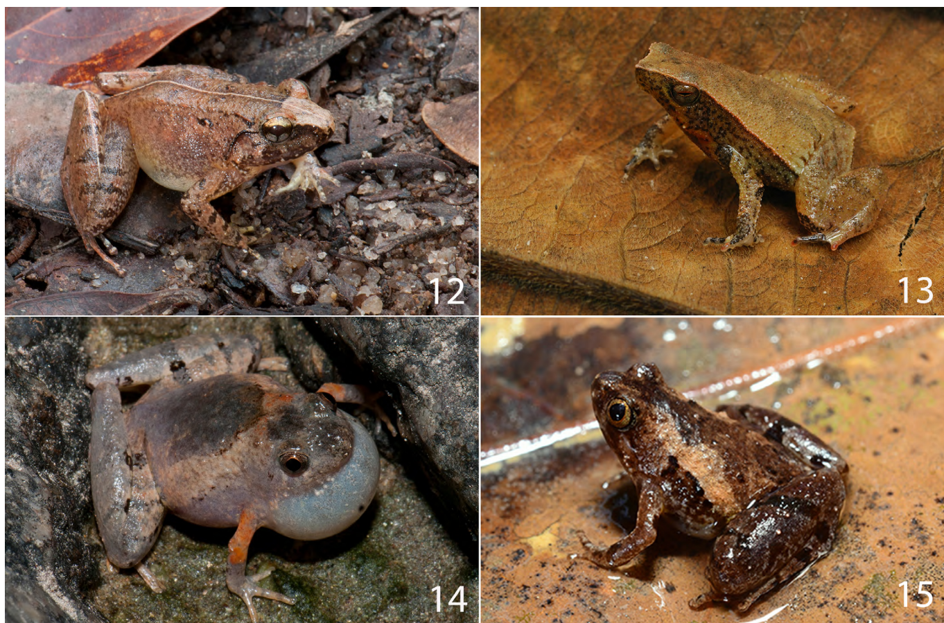
Figures 12–15. Lowland frogs. 12: Taylorana hascheanus from Lata Tembaka. 13: Kalophrynus pleurostigma from Lata Tembaka. 14: Microhyla cf. berdmorei from Lata Tembaka, 15: Microhyla superciliaris from Lata Belatan.

base of a large dipterocarp, tree on the side of a hill deep within primary rainforest. Dring collected this specimen in leaf litter in secondary forest at Sungai Kelebang.