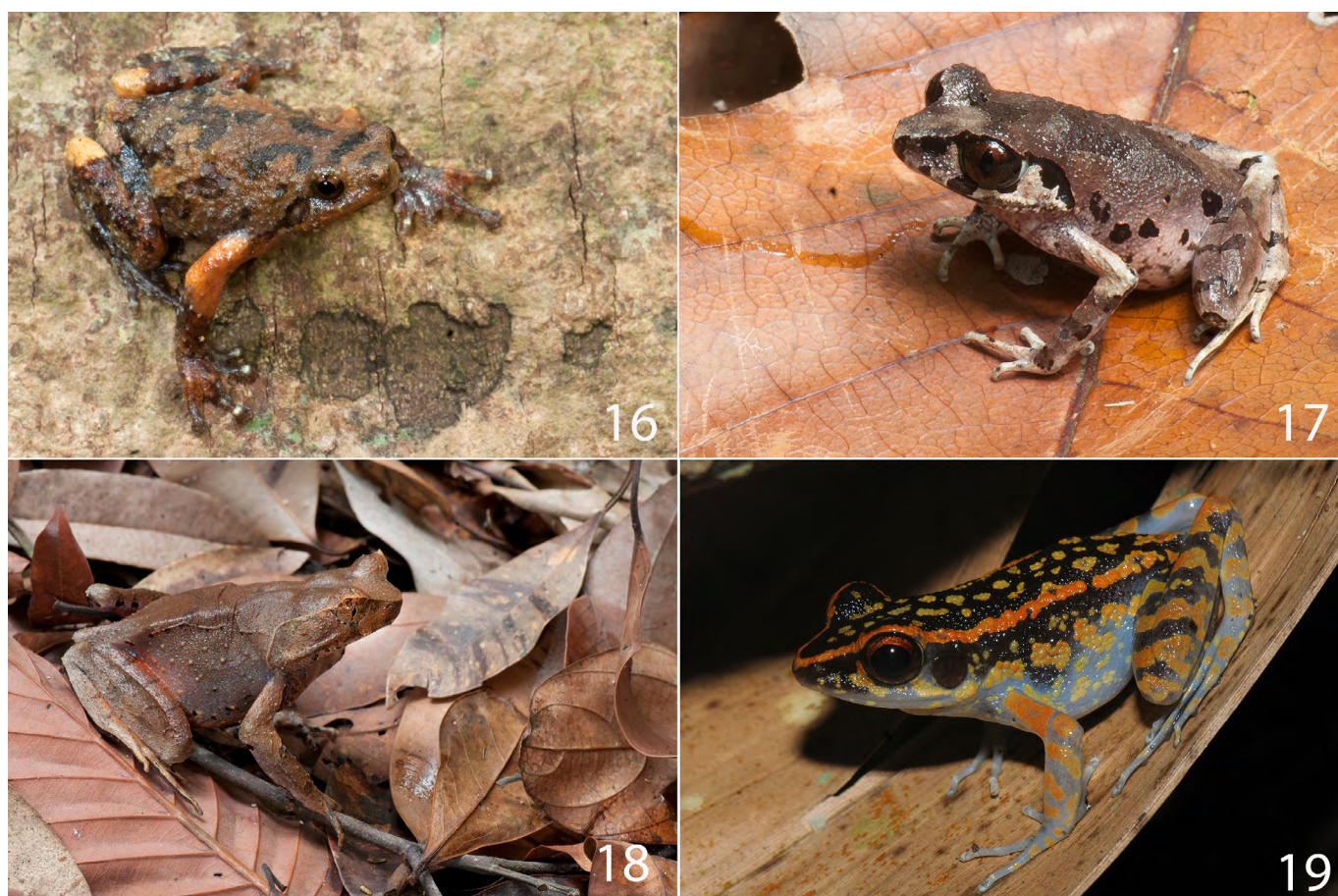
Figures 16–19. Frogs from Gunung Tebu and Lata Tembaka. 16: Metaphrynella pollicaris from Gunung Tebu, 17: Leptotalax sp. from Gunung Tebu, 18: Xenophrys aceras from Gunung Tebu, 19: Hylarana picturata from Lata Tembaka.

This species was heard calling at night in thick primary