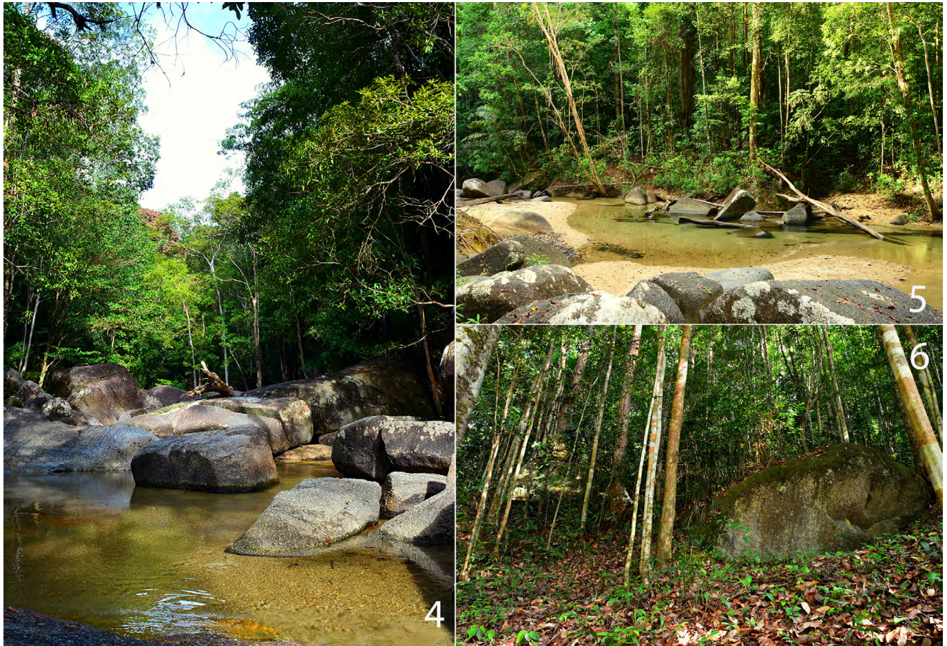
Figures 4–6. Lata Belatan habitat. 4 and 5: Lowland riparian forest, 6: Low hill dipterocarp forest.

each individual and stored in 100% ethanol. Specimens were fixed in 10% formalin and later transferred to 70% ethanol.