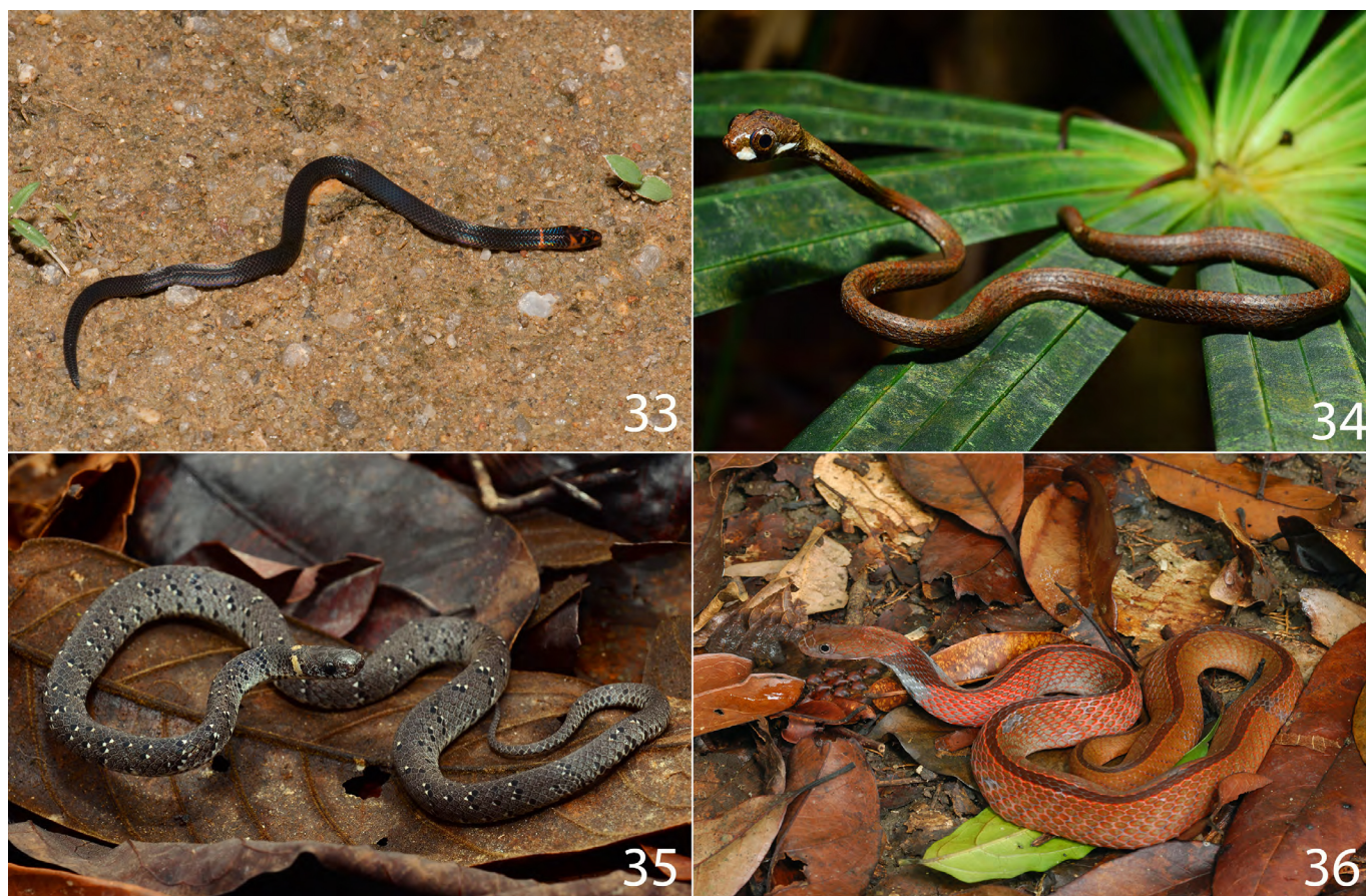
Figures 33–36: Snakes from Gunung Tebu, Lata Belatan, and Lata Tembaka. 33: Pseudorhabdion sp. from Gunung Tebu. 34: Aplopeltura boa from Gunung Tebu. 35: Pareas margaritaphorus from Lata Belatan. 36: Macropisthodon rhodomelas from Lata Tembaka.

in both primary forests and anthropomorphic settings.