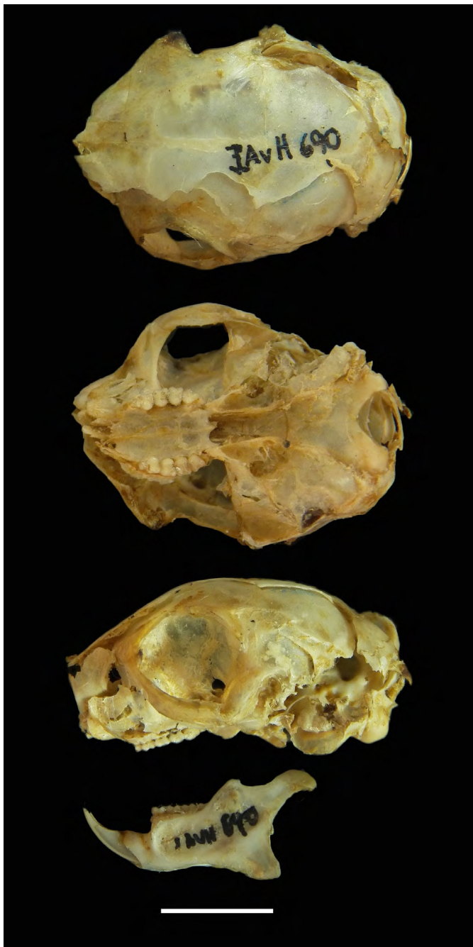
Figure 3. Skull and mandible of Sciurillus pusillus (IAvH 690). Top to bottom: dorsal, ventral and lateral views of skull, and lateral view of lower jaw. Scale 10 mm.

More precisely, there are now several examples of small terrestrial and arboreal mammals with populations occurring on either side of Putumayo River (Gómez-Laverde et al. 2004; Voss et al. 2009; Rossi et al. 2010; Díaz-N 2012). Although our records add important information to the limited knowledge on this species, many gaps still remain in our understanding on the geographical and species limits within this clade. Moreover, several lines of evidence, including molecular divergence and morphological variation, might suggest that the monotypic genus Sciurillus has more diversity than what is currently recognized. For instance, Roth and