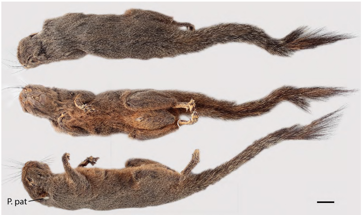
Figure 2. Fluid preserved specimen of Sciurillus pusillus (IAvH 690) in dorsal (top), ventral (middle), and lateral (bottom) views. Postauricular patch (P. Pat). Scale 10 mm.

(Figure 3). Based on the morphological characters of the two skins and the craniodental characters that we could record, we conclude that the specimens IAvH 690 and 2631 follow the description of the species S. pusillus as currently recognized. Furthermore, the specimens examined provide evidence of the material that Alberico et al. (2000) probably were referring to for including the species S. pusillus in the list of mammals of Colombia.