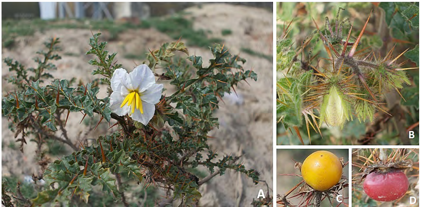
Figure 1. Habit, flowering and fruiting of Solanum sisymbriifolium Lam. A , plant body with flower under natural habitat; B , bunch of flower buds with numerous prickles; C , unripe mature berry; D , Ripe berry.

The study area (located between 27°05' to 27°40' N, 083°30' to 84°00' E) is characterized by quite even topography and fine alluvial deposits drained by several rivulets. The landscape comprises a mosaic of human habitations, agricultural fields, grasslands, commercial plantations and forests. The climate is typically monsoonic with three distinct seasons. Relative humidity ranges between 74–87% and the mean temperature range is 12–39°C. Diverse topographic features here offer many habitats and microhabitat types for a variety of herbs to grow across the grassy landscape of the region. The soil is largely a Gangetic alluvium, ranging from clayey to sandy loam in texture.