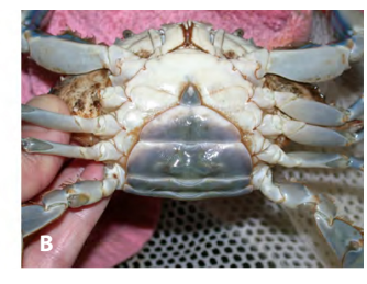
Figure 3. Sexual dimorphism of Callinectes sapidus . A, male morphology. B, female anatomy.

back July 2007 (Turolla, personal observation), which reports on single adult specimen. Further and more consistent spotting has occurred since 2010. However, it is hard to quantify the presence of such species, because nobody is actually monitoring or studying its population dynamics. What is significant about the Blue Crabs in the Sacca di Goro is that the great numbers have led local anglers to embark a business associated with these animals.