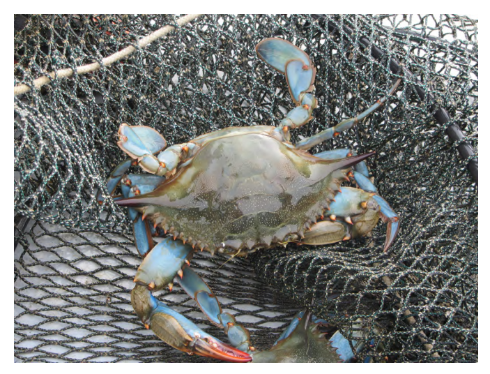
Figure 2. Specimen of Callinectes sapidus harvested in the Sacca di Goro lagoon.

initially, but has now reached the Northern Adriatic Sea coasts. Previous notes of the presence of C. sapidus in Italy go back in 2006 in South Italy (Gennaio 2006), the Gargano National Park (Florio 2008), the Abruzzi region (Castriota 2012), the Acquatina lagoon, and Torre Colimena basin (SE Italy) (Mancinelli 2013) as well as in neighbouring coutries such as Turkey (Tuncer 2008), Albania (Beqiraj 2010), Croatia (Dulcic 2010, 2011), and along the Mediterranean coast of the Iberian Peninsula (Castejón 2013). This indicates that C. sapidus is under an active spread within the Mediterranean basin.