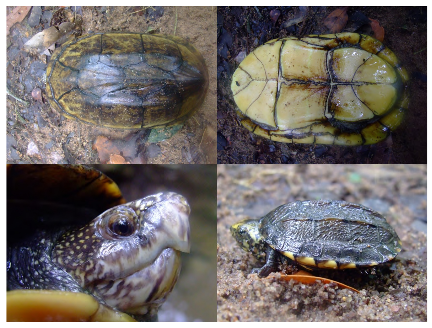
Figure 1. Kinosternon s. scorpioides from the Santa Teresa mountain range. HCPAPI 489 (top and left bottom) and HCPAPI 490 juvenile from the same location (right, bottom), Mato Grosso do Sul, Brazil, January 2008.

they were observed (Figure 1). The pictures are cataloged in the database of the Embrapa Pantanal Vertebrate Collection (HCPAPI 489 and HCPAPI 490). Additionally, we received one adult individual found the downtown Corumbá, Mato Grosso do Sul, Brazil, (19°00'27" S, 057°39′05" W) in June 2009 which is preserved as a complete voucher in the Embrapa Pantanal Vertebrate Collection (HCPAP 491). The exact origin of this specimen is unknown, but local informants are aware of the occurrence of this turtle in small, permanent or seasonal streams running from the Urucum mountain range, located 15 km from Corumbá. Finally, in March 2014 we found another adult male at Santa Teresa Ranch, in the same location as the above-mentioned released individuals. Although this specimen bore evidence of carnivore mammal attack, it was complete and preserved as a voucher at the Embrapa Pantanal Vertebrate Collection (HCPAP 500). Our findings represent a range expansion of more than 300 km from the nearest known locations from the south (see Berry and Iverson 2011), and more than 800 km from the nearest records in the north (see Costa et al. 2010) (Figure 2).