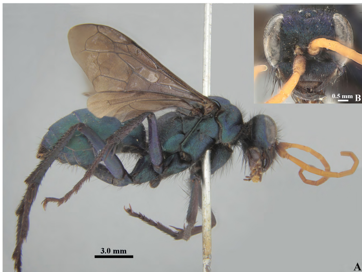
Figure 2. Pompilocalus guaymallen Roig-Alsina. A: lateral habitus; B: frontal view head.