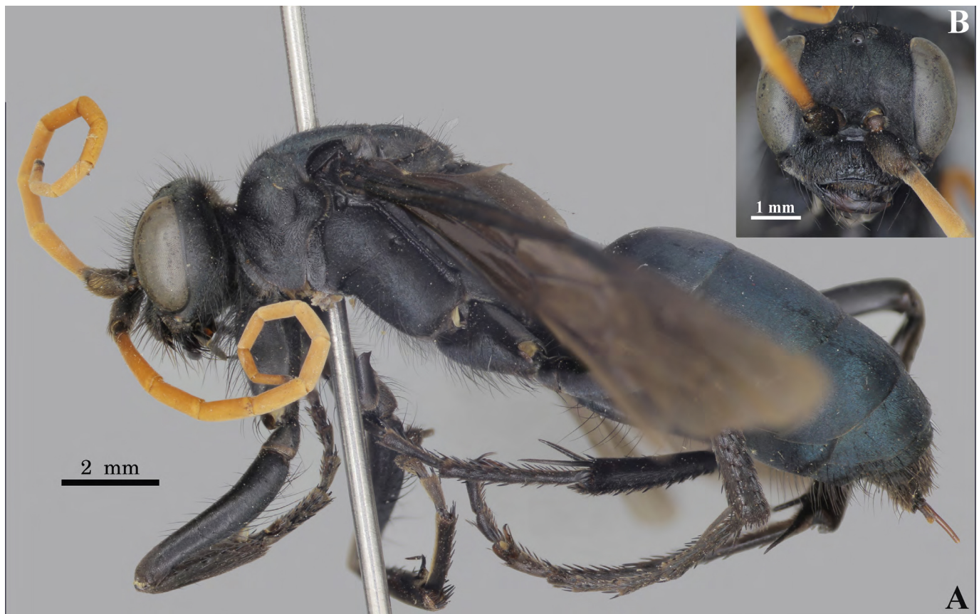
Figure 4. Pompilocalus tupi Roig-Alsina. A: lateral habitus; B: frontal view head.

into the SATZ during the Tertiary and Pleistocene, as a result of the tropical forests in temperate and arid communities. In this way, Pompilocalus may have started its diversification in the Andean Region reaching the SATZ and the southern Neotropical Region. In addition, Roig-Alsina (1989) highlights that species of Pompilocalus commonly occur in semi-desertic, desertic and in highland ecosystems. Regarding the aspects discussed above, the occurrence of this genus in such ecosystems is more related to its evolutionary history than its ecological aspects because the predominant ecosystem in these regions is desert and semidesert (Fearnside 2001; Pallarés et al. 2005).