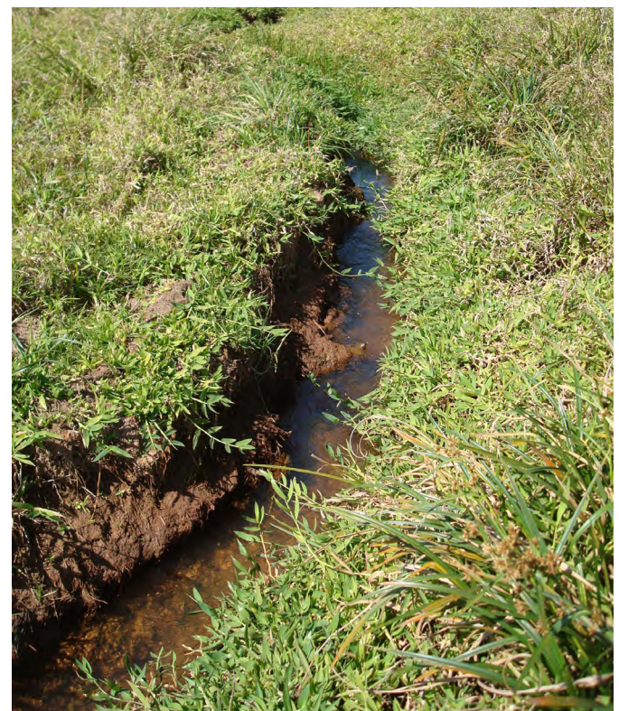
Figures 3 and 4. Habitat of the stream reach where Crenicichla semifasciata was sampled. 3: grasses (Poaceae) located inside of the stream pool and 4: stream run.