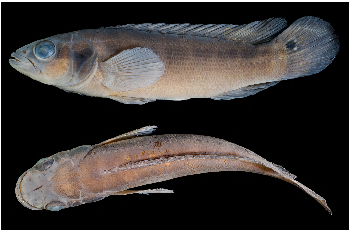
Figure 2. Crenicichla semifasciata , DZSJRP 19284, 110.9 mm SL, from Ribeirão Buritis, rio São José dos Dourados drainage, upper rio Paraná basin. Lateral (above) and dorsal (below) views.