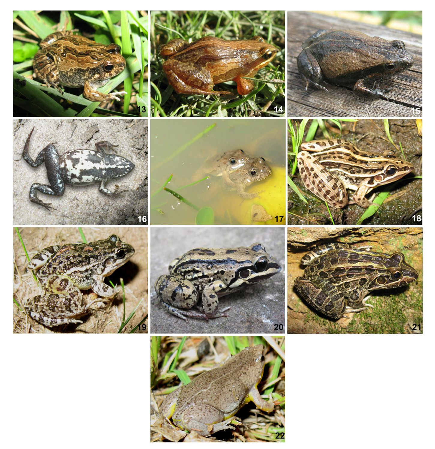
Figure 2. Continued. 13) Physalaemus biligonigerus, 14) Physalaemus henselii, 15) and 16) Physalaemus riograndensis (dorsal and ventral view respectively), 17) Pseudopaludicola falcipes, 18) Leptodactylus gracilis, 19) Leptodactylus latinasus, 20) Leptodactylus mystacinus, 21) Leptodactylus latrans, 22) Elachistocleis bicolor.

as priority for conservation with confirmed presence in Cerro Verde are L. latrans , M. montevidensis , P. bibroni and O. maisuma . As they were not found during this study in the area, the species A. siemersi and C. ornata were considered as potential priorities for conservation.