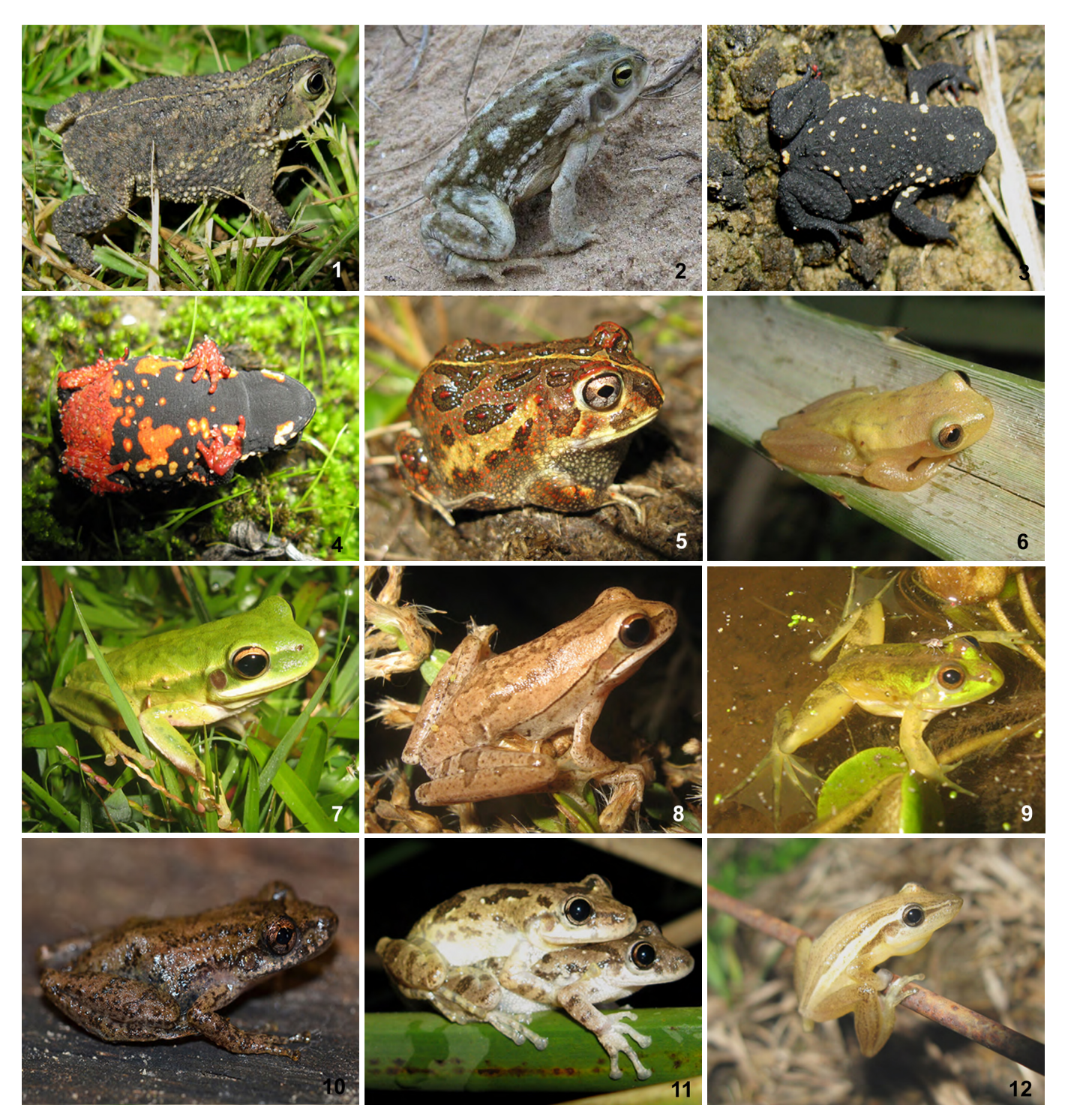
Figure 2. Species found during nocturnal surveys in Cerro Verde. 1) Rhinella dorbignyi , 2) Rhinella arenarum , 3) and 4) Melanophryniscus montevidensis (dorsal and ventral view respectively), 5) Odontophrynus maisuma , 6) Dendropsophus sanborni . 7 and 8) Hypsiboas pulchellus (green and brown individuals respectively), 9) Pseudis minutus , 10) Scinax berthae , 11) Scinax granulatus , 12) Scinax squalirostris .

The conservation status of the 23 species is presented in Table 2. At a national level, the threatened