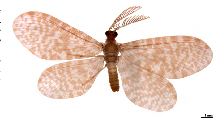
Figure 1. Dorsal habitus of Nallachius limai Adams, 1970 (Neuroptera: Dilaridae), male, from Campos do Jordão, state of São Paulo, southeastern Brazil.

articulated mediuncus lobes. Nallachiinae has the ectoprocts developed, often with a pair of modified dorsal lobes abutting on a modified ninth tergite. Are found gonocoxites and mediuncus lobes similar to Dilarinae, and a median sclerite is presented, articulated on the gonarcus (Adams 1970).