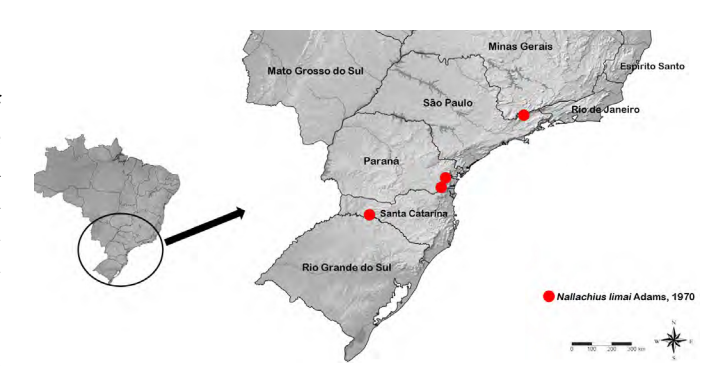
Figure 3 . Geographic distribution of Nallachius limai Adams, 1970 (Neuroptera: Dilaridae).

This note reports the first record of N. limai for the state of São Paulo (Figure 3). One male was collected with a Malaise trap on 22 November 2010 in Parque Estadual Horto Florestal (22°40′57″ S, 045°27′11″ W), Campos do Jordão. This biological station was created in 1941 for an area of 8.341 hectares with an important remnant of Atlantic Forest having a mosaic with three distinct facies: the forest with Araucaria and Podocarpus , altitude fields and cloud woods (Governo do Estado de São Paulo 2014). Actually, it has been shown for several groups (Calor et al. 2006; Falaschi and Amorim 2009; Oliveira and Amorim 2010) that the fauna in higher altitudes in the states