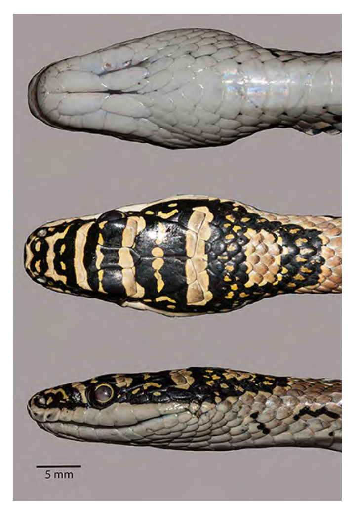
Figure 2. Ventral, dorsal, and lateral views of the head of Chrysopelea taprobanica (BLT 076, SVL 589 mm) collected from Seshachalam hills, Chamala, Andhra Pradesh, India.

Based on the colour pattern, morphometric comparisons, and genetic analysis, the identity of the specimen BLT 076 was confirmed as Chrysopelea taprobanica . It was clearly separated from C. ornata (the only other member of the genus present in mainland India) based on the presence of an undivided