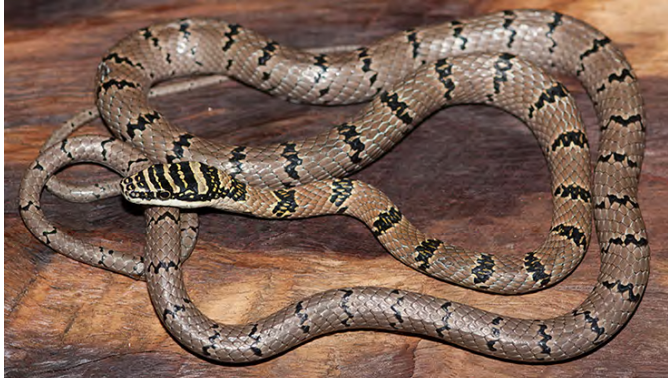
Figure 3. Full body profile of Chrysopelea taprobanica (BLT 076, SVL 589 mm) collected from Seshachalam hills, Chamala, Andhra Pradesh, India.