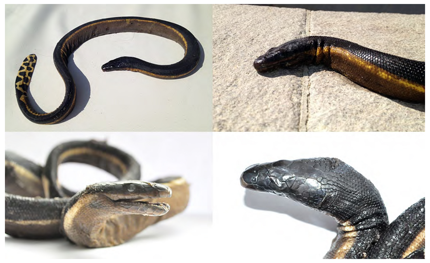
FIGURE 2. Two upper photographs show the individual in Máncora immediately after capture, two lower photographs show the preserved individual (CORBIDI 13619).

was preserved in formaldehyde (20%) and deposited in the Herpetological Department Collection of the Non-Government Organization CORBIDI (Ornithological and Biodiversity Center) in Lima, Perú (CORBIDI 13619). Here follows a brief description of the specimen: adult male, total length 660 mm, tail length 80 mm, head long and flattened, large scales on upper head, 10 supracaudal scales, 11 infra-caudal scales, 56 dorsal rows at the midbody, squared and juxtaposed small dorsal scales, 428 small and divided ventral scales, 49 sub-caudal scales, laterally flattened tail, dorsum black contrasting with a light brown belly, dorsal coloration abruptly differentiated from the ventral color by a uniform 0.5 cm width yellowish band extending from the rear of the head to the origin of the tail, tail with black and yellow reticulations.