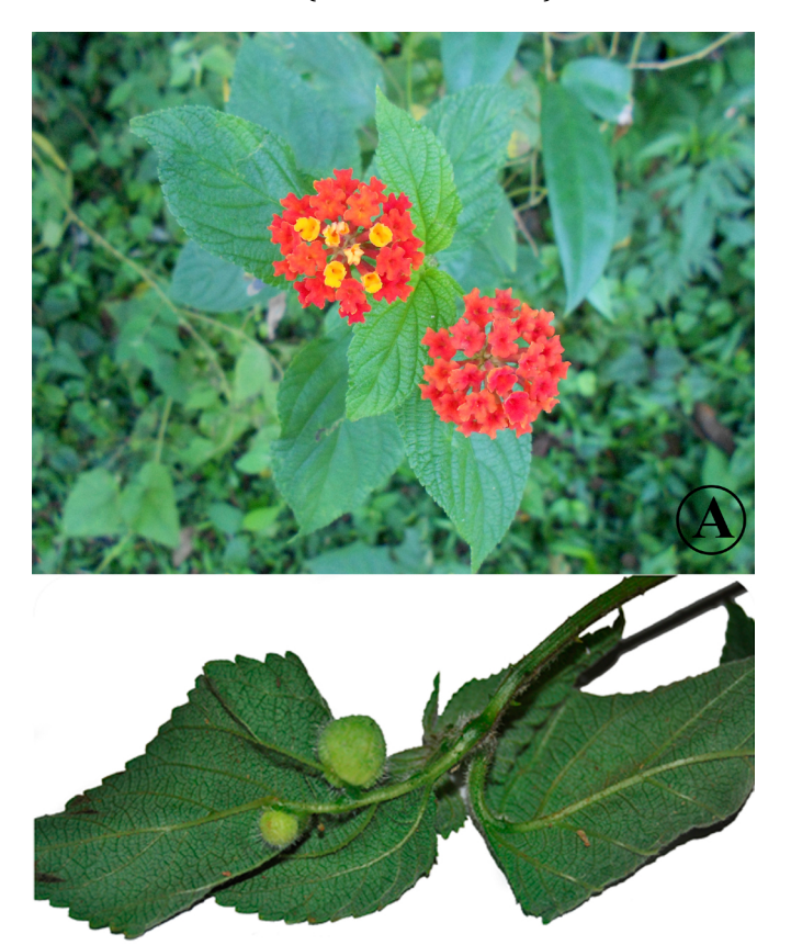
FIGURE 1. A: Lantana camara L. (Verbenaceae) in Valença (Rio de Janeiro); B: Gall of Schismatodiplosis lantanae (Rübsaamen, 1907) (Diptera, Cecidomyiidae) on leaves of Lantana camara L. (Verbenaceae).

Valença—Parque Natural Municipal do Açude da Concórdia (22°21′0″ S, 43°45′50″ W) and Santuário de Vida Silvestre da Serra da Concórdia (22°24′ S, 43°47′ W) from November