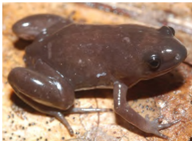
FIGURE 1. Adelastes hylonomos (INPA-H 32510, male) from Santa Isabel do Rio Negro, Amazonas state, Brazil. (Photo: M. Gordo).

The following values of the vocalization are presented as minimum-maximum (average \pm Standard Deviation). The advertisement call is composed by 15–21 notes (18.5 notes \pm 1.6, n = 4 calls) (Figure 3A–C), with call length varying from 2.8 to 3.4 s (2.9 s \pm 0.27). The note is short trilled, between 0.02–0.03 s (0.03 s \pm 0.001) and is repeated at irregular intervals of 6.1–6.9 notes per second (6.39 s \pm 0.21). Dominant frequency is 2250–2737.5 Hz (2383.29 \pm 166.77 Hz) at temperatures between 25.5–26°C. The acoustics parameters found in this study are similar to described by Zweifel (1986).