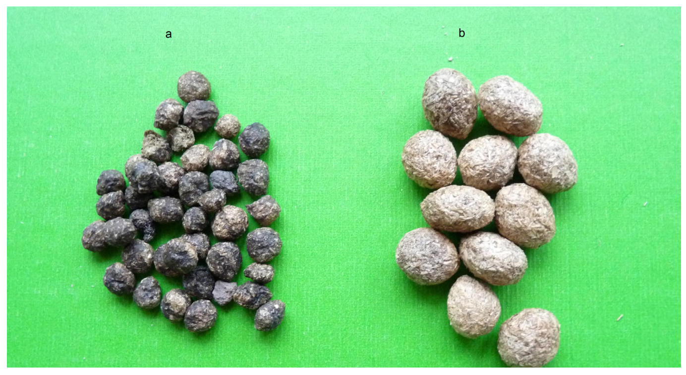
FIGURE 2. a: Fecal pellets of European rabbit (Oryctolagus cuniculus); b: European hare (Lepus europaeus)

Rabbit presence was confirmed in forests, shrublands, and wet meadows in northern NHNP. Fecal pellets were more abundant in meadows adjacent to Siete Lagos route (47% of sampling units) than in shrublands and forests (39 and 14% of sampling units respectively, Figure 3).