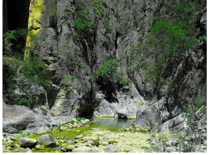
FIGURE 4. Limestone canyon with elements of Piedmont scrub in Los Rayones.

The cordillera runs through a large number of states, including Coahuila, Nuevo León, Tamaulipas, Texas, San Luis Potosí, Hidalgo, Tlaxcala, and others. The Pygmy Alligator Lizard inhabits only the states of Coahuila, Nuevo León, and Tamaulipas in Mexico.