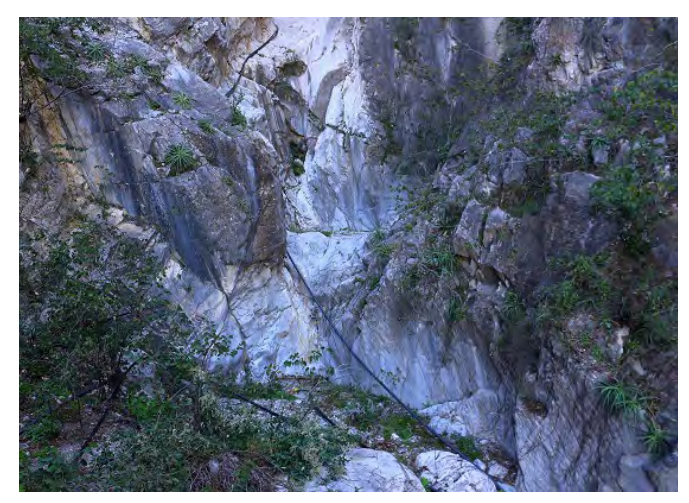
FIGURE 5. New locality of Gerrhonotus parvus in Santa Catarina.

While sampling for herpetofauna in the municipalities of García and Santa Catarina, Nuevo León (Figure 1), we collected in the municipality of Santa Catarina a female specimen of Gerrhonous parvus in the locality known as Cañon Reflexiones (Figure 5). This specimen collection was approved by the SEMARNAT (Secretary for Environment Protection Management), under permit number SGPA/DGVS/01511/12 and 01589/12. The specimen (Figure 6) was deposited in the herpetological collection of the Universidad Autónoma de Nuevo León (UANL), catalog number UANL-7275. The specimen was identified using Good 1988. We measured (using vernier Helios accuracy 0.05 mm) snout-vent length (SVL) and tail length (TL) and recorded the temperature of the body and microhabitat (using RayTek ST30 Pro Enhanced).