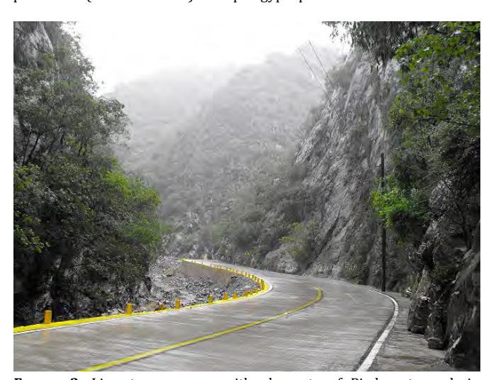
\begin{tabular}{ll} \textbf{FIGURE 3.} Limestone canyon with elements of Piedmont scrub in Santiago. \end{tabular}