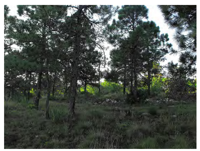
FIGURE 2. Type locality of Gerrhonotus parvus , transition zone between pine forest ( Pinus arizonica ) and open gypsophilous scrub in Galeana.

This group is distributed in northeastern México along the Sierra Madre Oriental, a mountain range approximately 1,350 km long, paralleling the Gulf of Mexico, and terminating to the south in the Neovolcanic Axis, which divides North America from Central America.