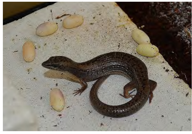
FIGURE 7. Litter of six Gerrhonotus parvus eggs.

This specimen of Gerrhonotus parvus represents the first record for the municipality of Santa Catarina, as well as the northernmost recorded for the species, extending its range 48.2 km northwest of the previously known localities (Banda-Leal et al. 2002). Currently, Gerrhonotus parvus is under the status of special protection by the NOM-059-SEMARNAT (2010) and Endangered (B1 ab[iii] ver.3.1) by the IUCN (2013). The characteristics of the microhabitat of this site are very similar to those of the canyons of San Isidro and Mireles in the municipalities of Santiago and Los Rayones, which suggests that this species might have a preference for this type of habitat, rather than that of the type locality in Galeana, Nuevo León.