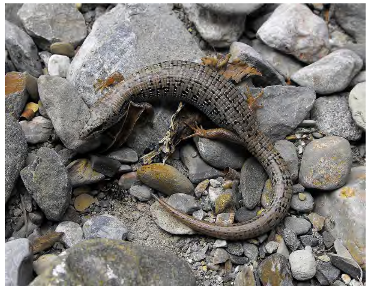
FIGURE 6. Female of Gerrhonotus parvus (UANL-7275) collected in Santa Catarina.

We collected the specimen of Gerrhonotus parvus on 30 March 2012, in Cañon Reflexiones (25°37'50.68" N, 100°41'58.47" W, WGS84, 1650 m), located 48.2 airline km. northwest from the nearest locality recorded in the municipality of Santiago, Nuevo León (Figure 1). We found the lizard active on the wall of the canyon at 14:00 h. The specimen had a SVL of 72.56 mm and a TL of 72.25 mm (incomplete). The ambient temperature was 24°C, while that of microhabitat was 16°C and the body temperature (BT) 17°C. Subsequently, on 9 May, the female laid six elliptical eggs that weighed on average 0.39 g ± 0.01 (0.37-0.41 g) and measured an average 13.06 mm \pm 0.05 (12.54-13.57 mm) in length and 7.27 mm ± 0.05 (7.18-7.36 mm) in width. Unfortunately, they did not develop (Figure 7). This is a larger litter size than peviously reported for the paratype, which was 4 eggs (Knight and Scudday 1985). This determination was verified by Robert W. Bryson.