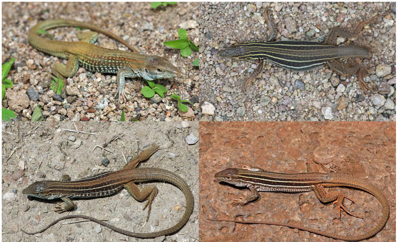
FIGURE 14. Composite image of Aspidoscelis cf. costata from the MEX 16 study area.

We found C. cf. molossus in all floristic divisions of the MEX 16 transect from areas of lowland thornscrub to cool mesic pine forest. We observed snakes resembling C. cf. basiliscus in lowland thornscrub between Curea and Nuri (Figure 15 – lower right). Although we observed significant variation in C. cf. molossus , we found it to be predictively variable and note a trend in color patterns (Figure 15) that may be associated with elevation or geographic distribution. The images in figure 15 are of snakes observed within the transect and depict a color pattern gradient from west-to-east (left-to-right) and north-to-south (top-to-bottom). Individuals of C. cf. molossus from west of 109.35° W (ca. 700 m) resemble C. m. molossus ; east of 109.08° W (ca. 1,335m) resemble C. m. nigrescens ; south of 28.31° N (ca. 500 m) resemble C. basiliscus , and between these areas (ca. 700-1,400 m) C. cf. molossus seems to possess composite color patterns of two or more of the taxa in question ( C. m. molossus , C. m. nigrescens , and C. basiliscus ).