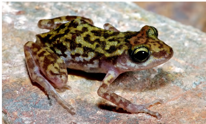
FIGURE 11. Eleutherodactylus interorbitalis from west of the Río Maycoba. July 2005.

Throughout this study we were faced with the challenging task of establishing, within the study area, the taxonomic identity of three wide-ranging morphologically variable and possibly composite taxa;