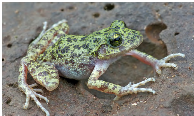
FIGURE 12. Craugastor tarahumaraensis near Mesa del Campanero. August 2007.

Lithobates cf. magnaocularis (Figure 13), Aspidoscelis cf. costata (Figure 14), and Crotalus cf. molossus (Figure 15). Although we took high-resolution photographs of salient features and compared them with species descriptions, relevant literature, and preserved specimens at UAZ, our assessments were often restricted by our inability to collect specimens and correspondingly we could not identify these three taxa to their respective individual species. Thus, our species assignments pertaining to them are tentative, and should be considered as open questions. In all cases, the geographic distributional boundaries of the taxa in question are nebulous and may abut or contact related species. We therefore provide summaries of our observations for each taxon to hopefully stimulate future systematic research.