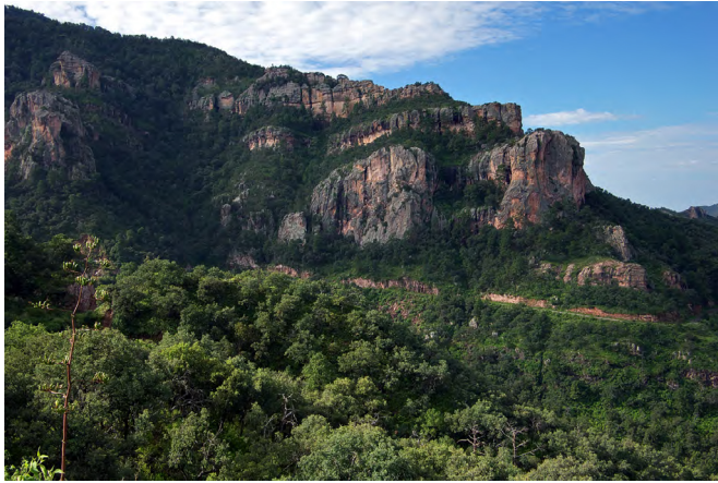
FIGURE 4. MEX 16 ascending the western slope of Mesa del Campanero. Photo by EFE, September 2009