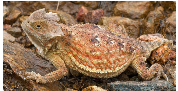
FIGURE 9. Phrynosoma ditmarsii , east of Baviacora, Sonora.