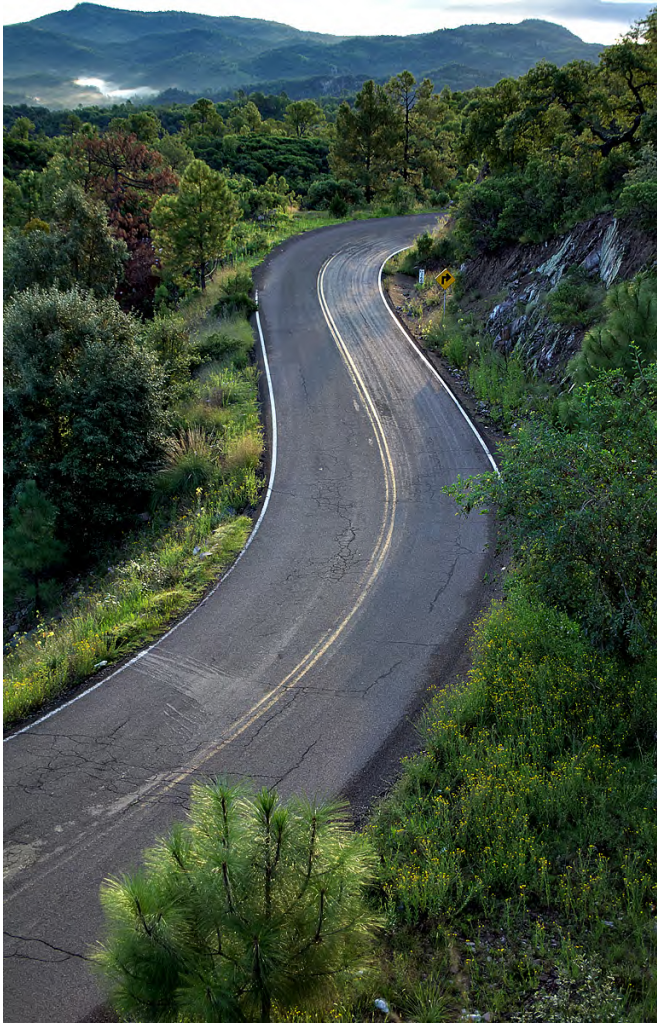
FIGURE 1. View of MEX 16 from Mesa del Campanero near Rancho la Cruz (1,947 m). Photo by EFE, September 2009