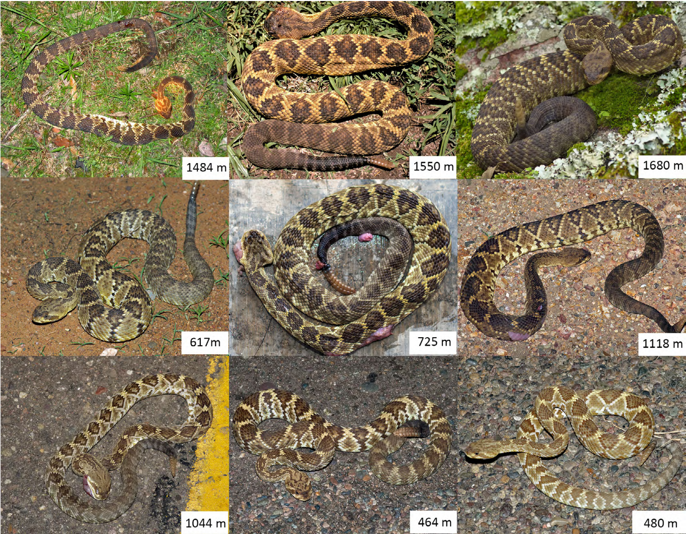
FIGURE 15. Crotalus cf. molossus from the MEX 16 study area showing the color pattern gradient from west to east (left-to-right) and north-to-south (top-to-bottom). Snakes are shown in west-east and north-to-south. Photos by Kevin Bonine (upper left), TRV (upper middle - UAZ 57056-PSV) and EFE, 2004–2008.

Oficial Mexicana, NOM-059-SEMARNAT-2010 (Diario Oficial de la Federación 2010; Table 1). This includes 15 species with Amenazada (threatened) and 21 species Protegida (Pr, special protection) status. Additional species in the Yécora herpetofauna that are rare or have very limited distributions warrant nomination for protection. These include Geophis dugesii , Phrynosoma ditmarsii , Pseudoficimia frontalis , Sceloporus slevini , Storeria storeroides , Sympholis lippiens , Tantilla wilcoxi , and Tropidodipsas repleta .