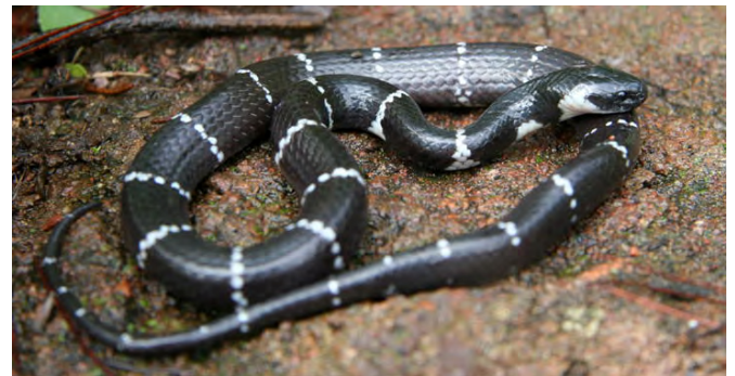
FIGURE 8. Tropidodipsas repleta from MEX 16.