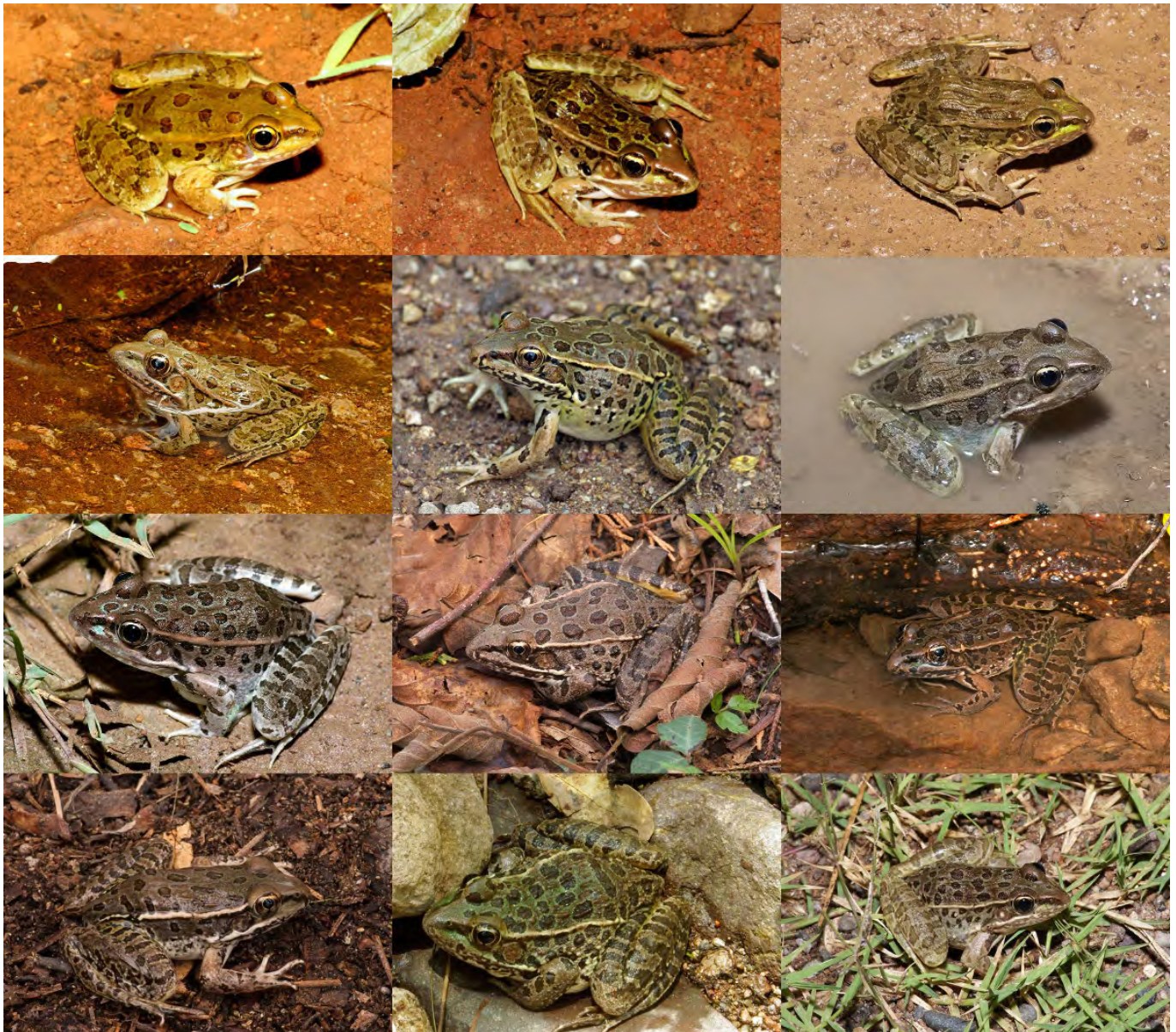
FIGURE 13. Composite image of Lithobates cf. magnaocularis from the MEX 16 study area. Photos by EFE, 2004–2008

We also tentatively assign our field observations to A. cf. costata on the basis of color pattern. The individuals