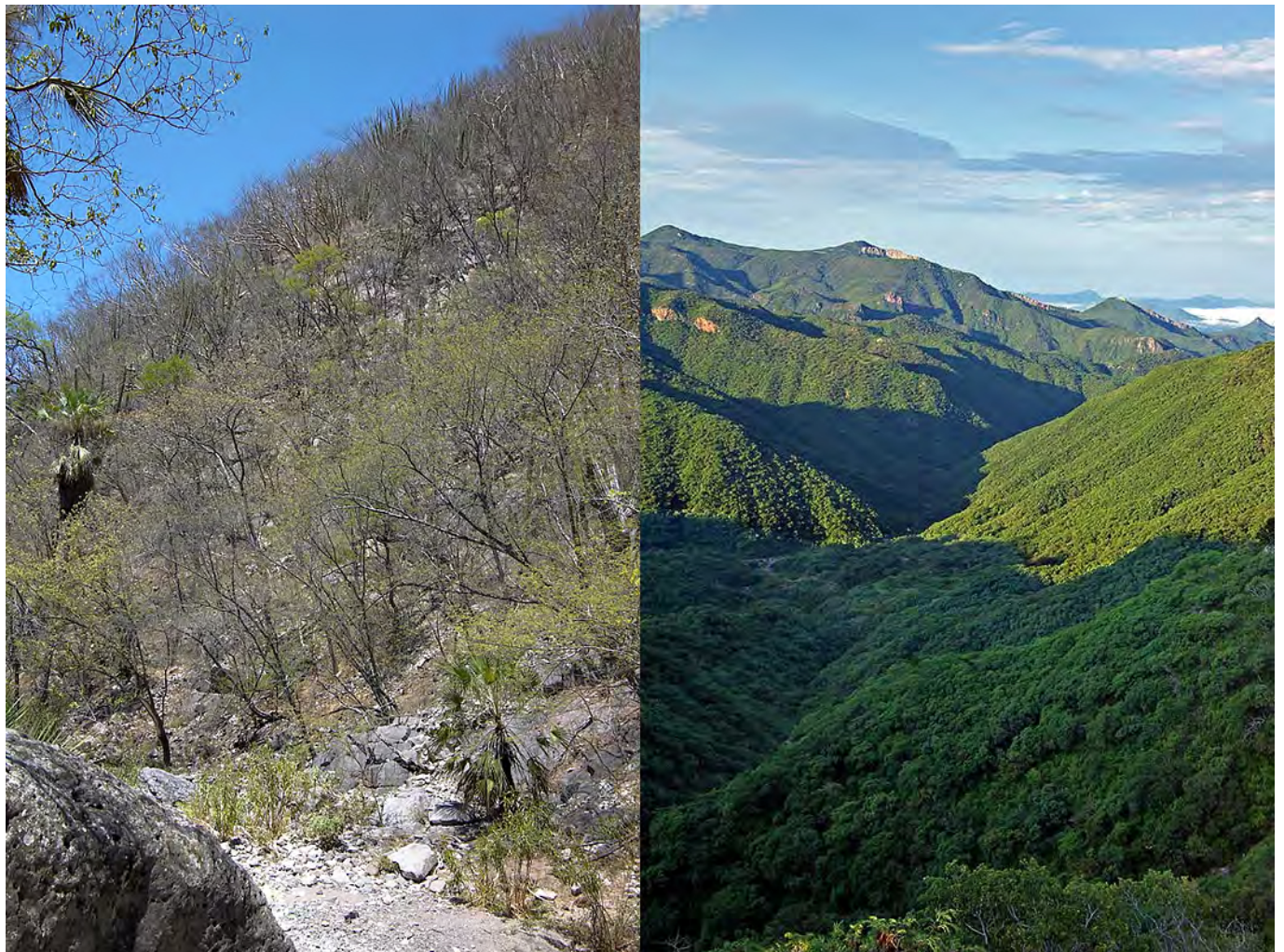
FIGURE 7. Dry and wet seasons in tropical deciduous forest along the MEX 16 transect. On the left, a predominately leafless forest in early July 2005. On the right, a lush a canopy in late September 2005.