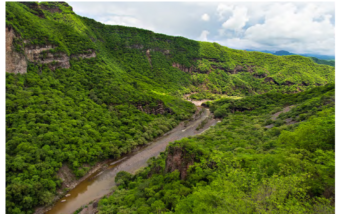
FIGURE 6. Tropical deciduous forest near Tepopa. July 2007

Amphibians and reptiles were encountered during field searches and driving roads at night. Many areas were visited at different times of the day and in different seasons, but most of the effort was in the summer rainy season in July-September. We acquired herpetofauna records from twenty-five institutions and supplemented these records with data available from online sources such as VertNet ( http://vertnet.org/index.php ) and scientific publications, particularly Enderson et al. (2009; 2010). The collections of the University of Arizona Museum of Natural History (UAZ) contain historical records from the Yecora