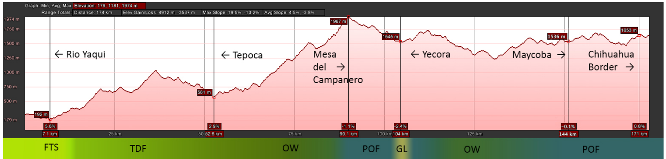
FIGURE 3. Elevational profile of MEX 16 within the study area, from west-to-east. Y-axis = elevation. X-axis = distance. Lower color gradient depicts biotic communities: TS (thornscrub), TDF (tropical deciduous forest), OW (oak woodland), POF (pine-oak forest), GL (grassland). Black vertical lines represent points of interest; places names are shown on either side of line.