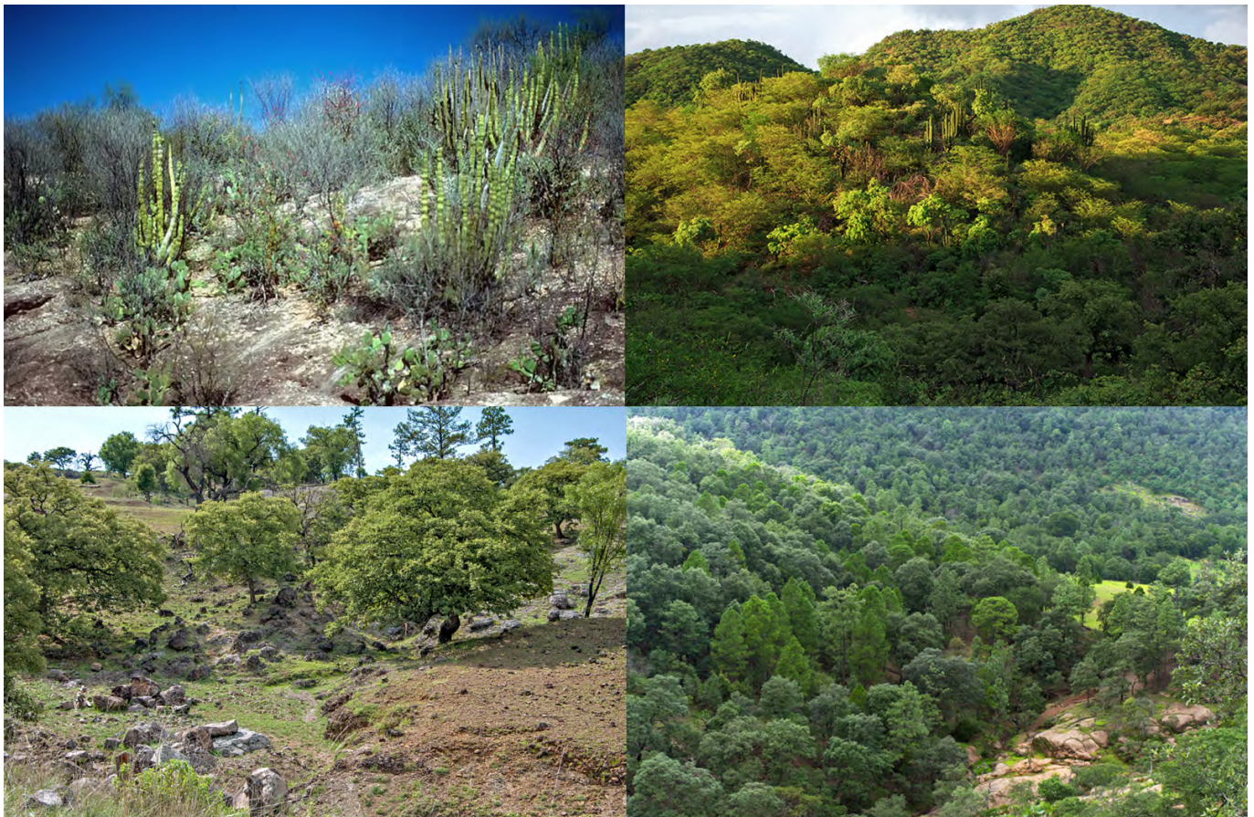
FIGURE 5. Photographs of select biotic communities along the MEX 16 transect. From top left-to-right: thornscrub near Curea, photo by TRV April 2000; tropical deciduous forest near San Nicolas, Photo by EFE, July 2007; oak woodland west of Maycoba, Photo by EFE, July 2005; pine-oak forest near Rancho el Horquetudo, photo by EFE, August 2008

In general, the climate grades west-to-east with elevation from seasonally dry tropical lowlands (Figure 7) to cool-temperate highlands. The western region from Tónichi to San Nicolás is tropical in character with dry winters and oppressively hot and humid summers that bring monsoon-like thunderstorms – their number and intensity increasing to the east with elevation. Semi-succulent tropical trees ( Plumeria rubra , Jatropha cordata ) grow to substantial heights here where frosts are uncommon. Tónichi, near the western edge of the transect, represents the driest and hottest locality with 612 mm mean annual precipitation and a mean annual temperature