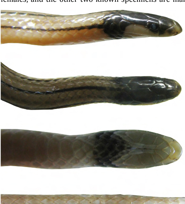
FIGURE 1. Lateral, dorsal and ventral views of the anterior portion of the body including the head and lateral view of the midbody of Apostolepis intermedia (MNHNP 11533).

Even though both referred specimens present larger ventral scale counts than the other known specimens of Apostolepis intermedia (211 – 217 ventral scales), and a slightly smaller subcaudal scale count (33 – 37 subcaudal scales), it matches the other diagnostic features presented in the diagnosis of Albuquerque and Lema (2012). Also, this variation might be explained by sexual dimorphism, considering that both (MHNP 11533, and 11636) are females, and the other two known specimens are males,