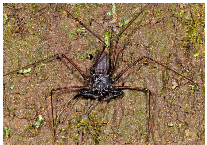
FIGURE 3. Heterophrynus armiger (Male) specimen from Ecuador. Dorsal view of live specimen.