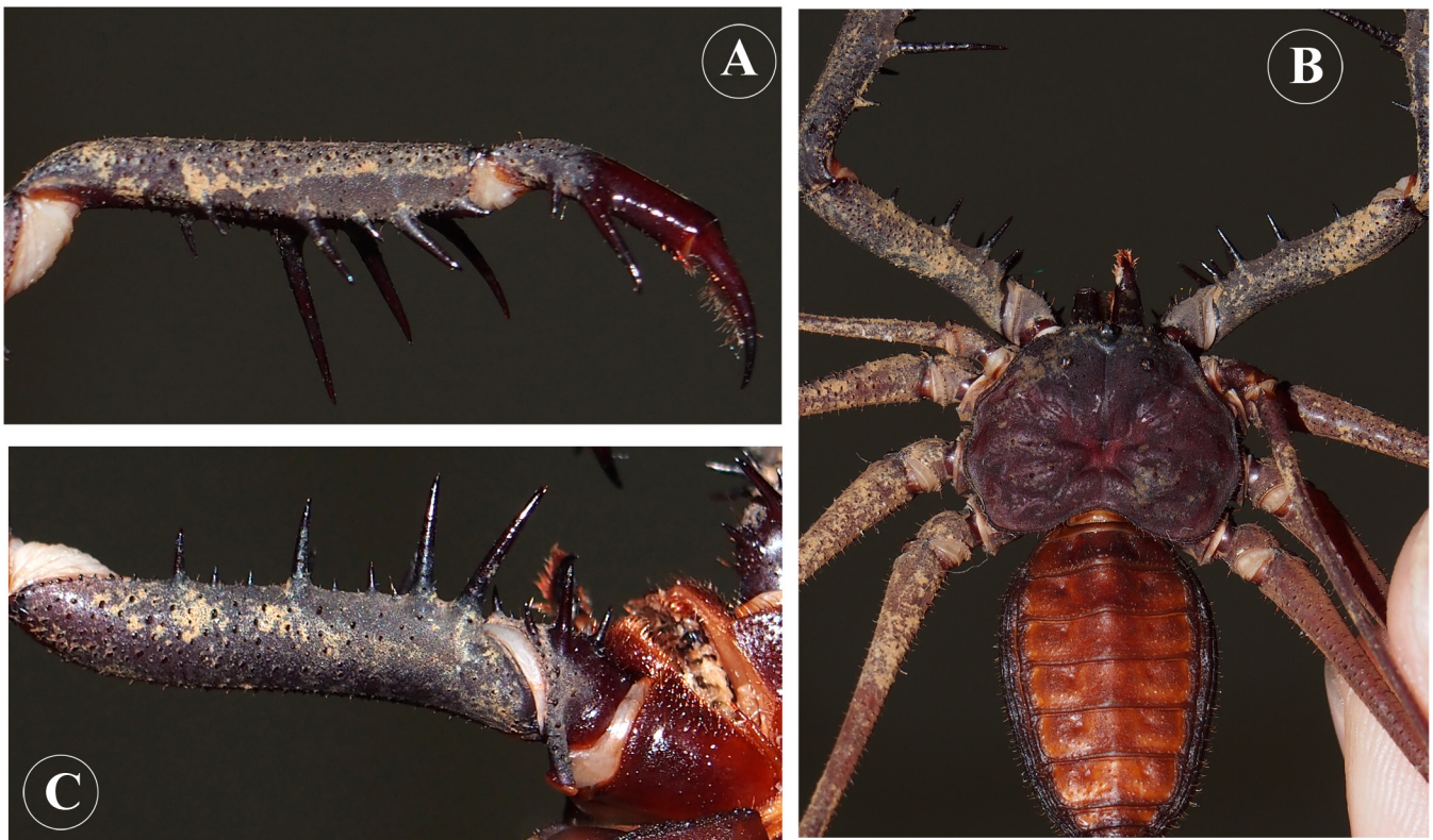
FIGURE 1. Heterophrynus armiger (Male), specimen from Colombia. A, Ventral aspect of pedipal tibia; B, General aspect of carapace and abdomen, dorsal view; C, Ventral aspect of pedipal femur.