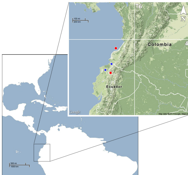
FIGURE 4. Geographic distribution of Heterophrynus armiger ; red circles show new records from Colombia and Ecuador; blue stars show registered records from Ecuador (Pocock 1902, 1903).