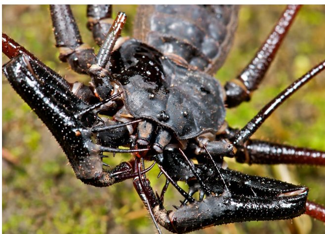
FIGURE 2. Heterophrynus armiger (Male) specimen from Ecuador. Frontal view of live specimen.