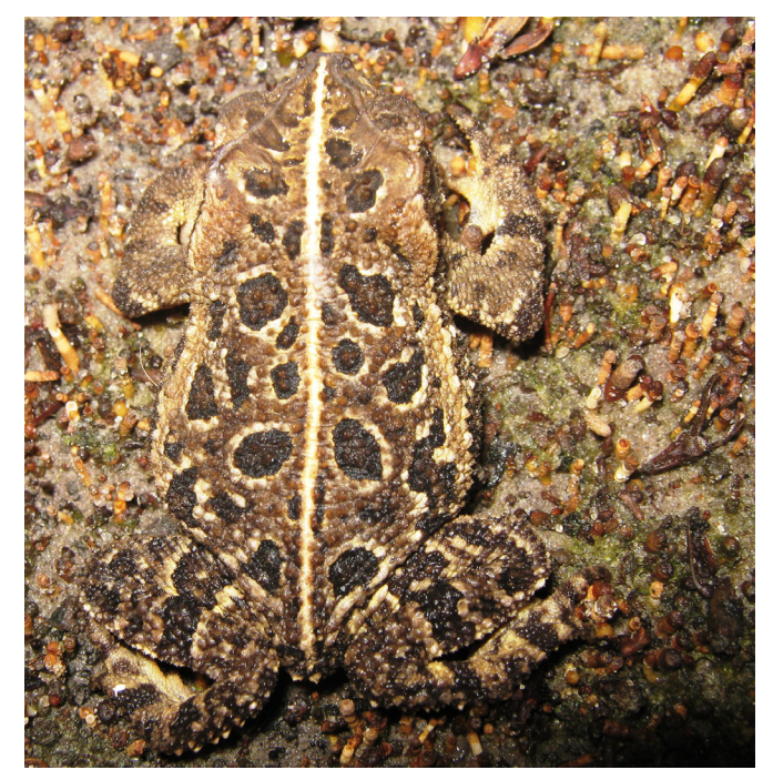
FIGURE 2. Adult male of Rhinella ocellata (43.70 mm SVL; CHUFMA 1047) recorded in the municipality of Primeira Cruz, state of Maranhão, northeastern Brazil. Photo: Rodrigo Matavelli (30/03/2010).

captured between 20:30h and 21:00h, also vocalizing on the banks of a slow lotic anthropic environment "buritizal", but located in coastal ecosystem "restinga environments" (Figure 3), being the first record of R. ocellata for a coastal ecosystem in Brazil and 4) São Bernardo (3°20'10" S, 42°30′01″ W; 117 m a.s.l): on July 13, 2010 an adult male was captured (36.3 mm SVL) between 5:30h and 6:00h on the roadside in the Cerrado biome "Cerradão", near a temporary pond. Voucher specimens are deposited in the Coleção de Herpetologia da Universidade Federal do Maranhão (CHUFMA 1102, 1136, 1047, 1101, 1100) and in the Coleção de Anfíbios da Universidade Estadual do Piauí, Parnaíba, state of Piauí (UESPI 151). This new record extends the distribution of Rhinella ocellata for coastal ecosystem in the state of Maranhão and for "restinga environments" by approximately 895 km north from the closest record located in Parque Estadual do Jalapão (10°32'59" S, 46°45'38" W), state of Tocantins (Caldwell and Shepard 2007).