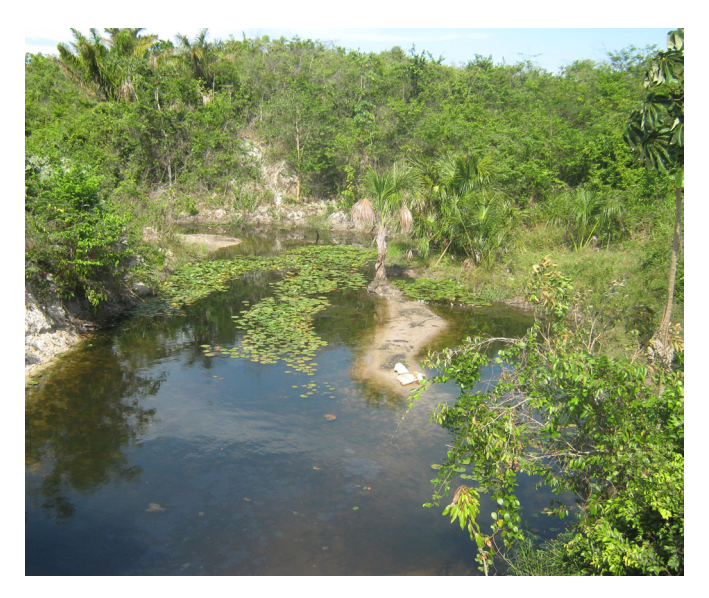
FIGURE 3. Slow lotic anthropic environment "buritizal" located in a coastal ecosystem "restinga environment" in the municipality of Primeira Cruz, state of Maranhão, northeastern Brazil.