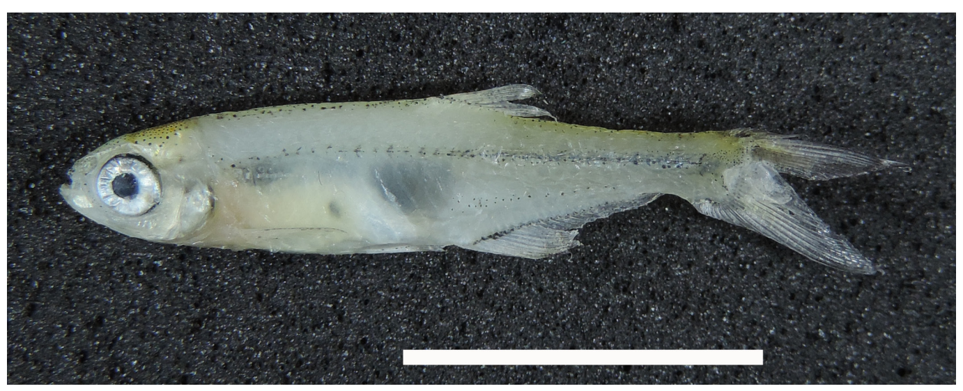
FIGURE 1. Preserved male of lotabrycon praecox collected in the Santa Rosa River (MECN-DP 2543). Note lack of adipose fin and presence of modified scale covering caudal gland at the posterior end of the caudal peduncle that characterize this species. Scale bar indicates 10 mm.