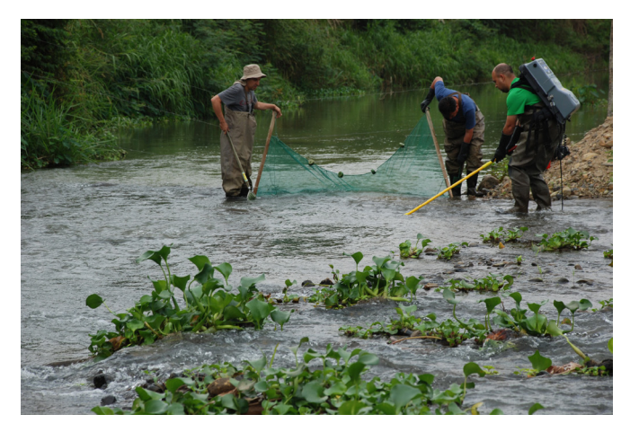
FIGURE 3. Habitat in which lotabrycon praecox was collected in the Santa Rosa River with collection methodology illustrated.

Little is known about the ecology of I. praecox and public available collection records are sparse. We searched the Vertnet (http://vertnet.org/index.php) and Fishnet2 (http://fishnet2.net/) online databases using the search term "Iotabrycon". We also specifically searched the online collection databases for museums most likely to possess lots of Iotabrycon including the National Museum of Natural History of the United States (USNM), the Field Museum of Natural History (FMNH), the American Museum of Natural History (AMNH), the Museum of Comparative Zoology (MCZ), the University of Florida Natural History Museum (FLMNH), Scripps Institute of Oceanography (SIO), the British Museum of Natural History (BMNH), and the Museum National d' Histoire Naturelle of Paris (MNHN), using the same search term. Finally, collections of the species made by some of the authors (Aguirre unpublished data) available at the Museo de Ciencias Naturales, Universidad de Guayaquil (UG) were also included. The results are listed in Table 1.