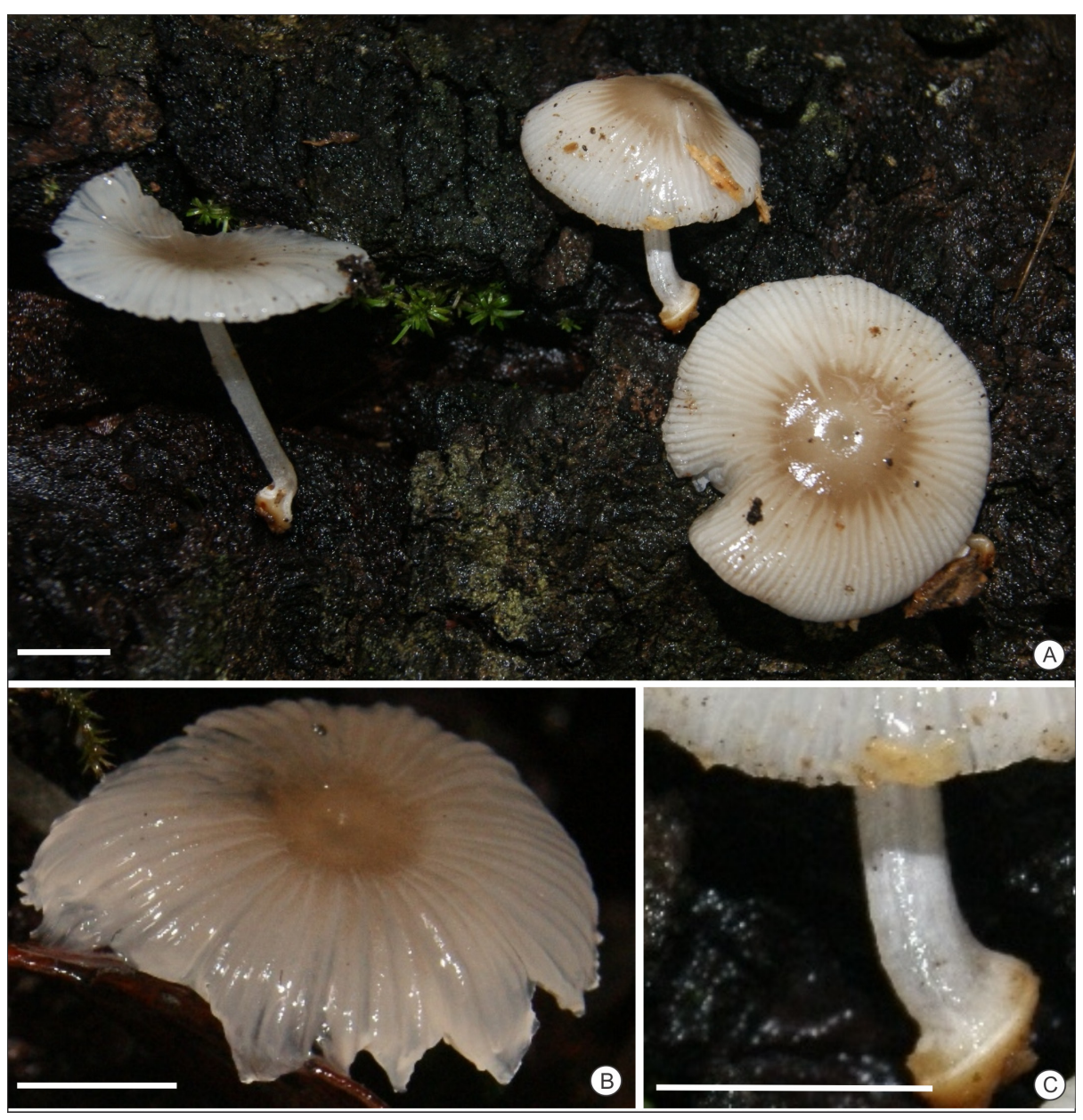
FIGURE 1. Mycena margarita. A. Basidiomes. B. Pileal detail. C. Stipe. Bars= 10 mm.

Pileus 15–38 mm diam., at first conical to campanulate soon becoming convex-hemispherical, than plano-convex with a flattened umbo that becomes slightly depressed in the center, surface white to pale grayish, pale brown on the disc, glabrous, subviscid to viscid, strongly hygrophanous, opalescent, translucent striate-sulcate with pale brown striae extending radially from the disc toward the edge, margin thin. Lamellae adnexed to adnate, subdistant, slightly broad with lamellulae of two lengths. Stipe 10–22 × 2–3 mm, cylindrical, central, hollow, equal, hygrophanous, with a cupulate basal disc in the substrate interface ;