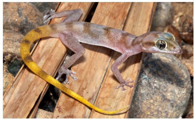
FIGURE 2. Adult male Asaccus gallagheri from Wadi Madhah.

While further genetic analysis may reveal that Asaccus gallagheri consists of two or more species, both of these records are near the type locality of Masafi, UAE and most likely represent true A. gallagheri .