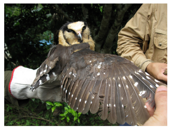
FIGURE 4. Aegolius harrisii, at Santa Rosa de Kuviriari, Cusco.