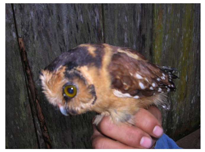
FIGURE 3. Aegolius harrisii, at Abra Patricia, Amazonas department.