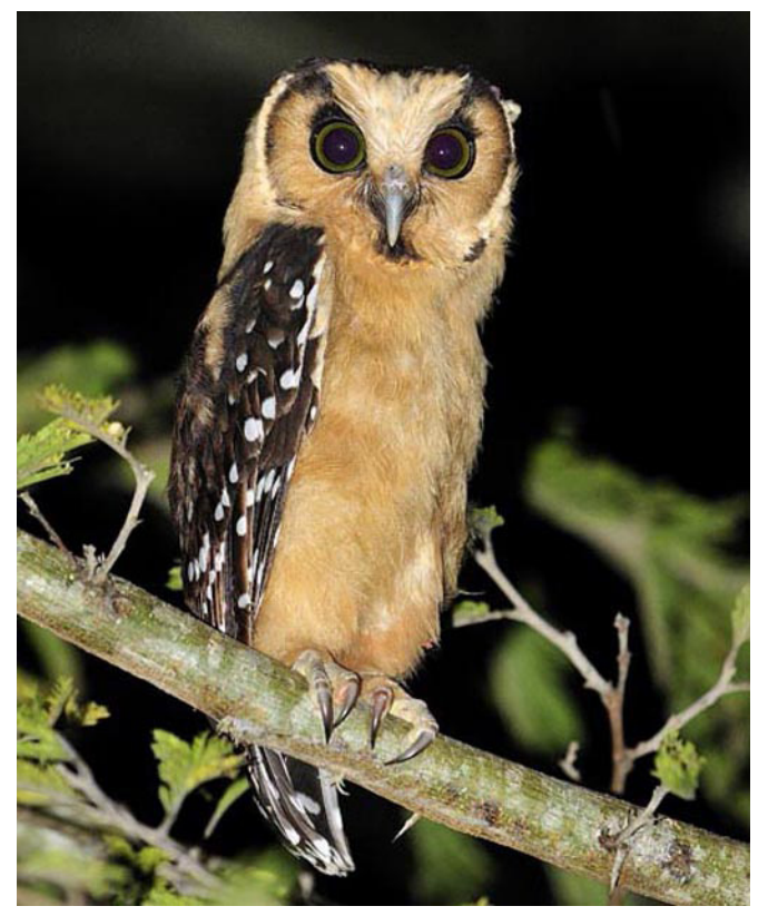
FIGURE 1. Aegolius harrisii at San Antonio Private Conservation Area, Amazonas department (Photo by Michell León).

We obtained information of six unpublished records from scientific collections, one unpublished recording of the species from Xeno-Canto (http://www.xeno-canto.