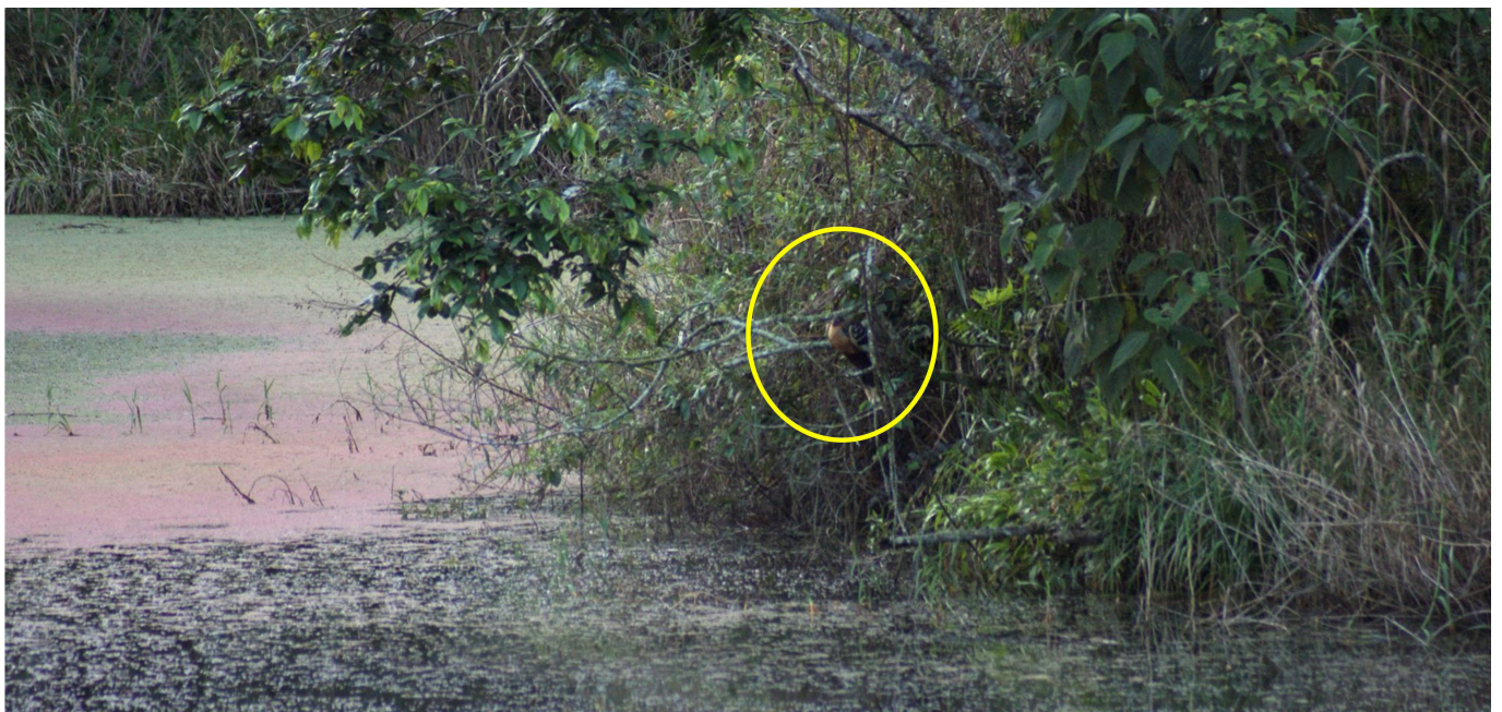
FIGURE 2. Adult of Hoatzin Opisthocomus hoazin observed in the border of El Blanquito reservoir in Yacambú National Park, Lara State, Venezuela. (Galo Buitrón-Jurado).