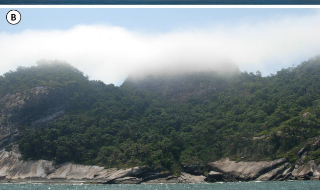
FIGURE 2. (A) Profile of Alcatrazes Island view from north to south, showing the inselberg landscape with marine rocky shores in lower portion and open forest, with predominance of trees of the family Myrtaceae and Syagrus romanzoffiana . (B) Low clouds surrounding the island top where dew provides liquid water to Alcatrazes plant community.