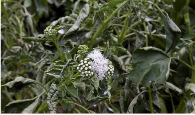
FIGURE 3. Chromolaena odorata (Asteraceae) showing the effect of salt deposition due to seabird colonies, with high nitrates and phosphates in their droppings.

reduced resources and could lead several species to local extinction. Therefore, these effects may cause difficulties in establishment of a butterfly species due to resources restriction for adults and larvae.