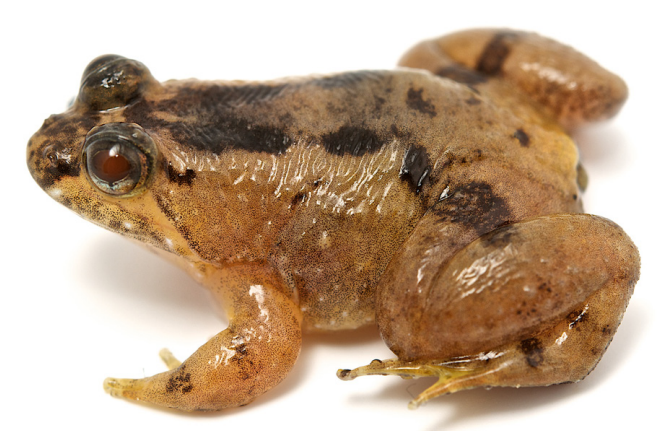
FIGURE 2. Limnonectes rhacodus specimen from Gunung Penrissen, Sarawak State, Malaysia, Borneo (ZMH A 11840, female, SVL 20.1 mm).