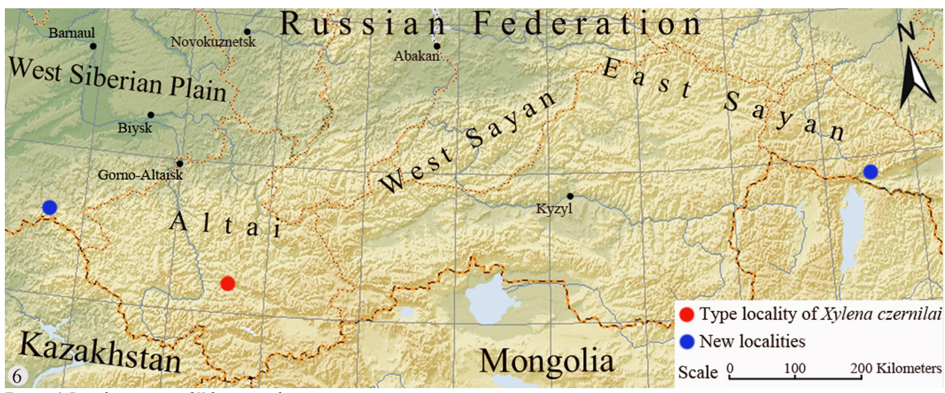
FIGURE 6. Distribution map of Xylena czernilai.

Diagnosis. The female genitalia of X. czernilai well differ from those of the related species X. vetusta by much larger and strongly sclerotized ostium bursae, broader and stronger sclerotized ductus bursae, longer and stronger sclerotized appendix bursae, shorter corpus bursae with two shorter signa.