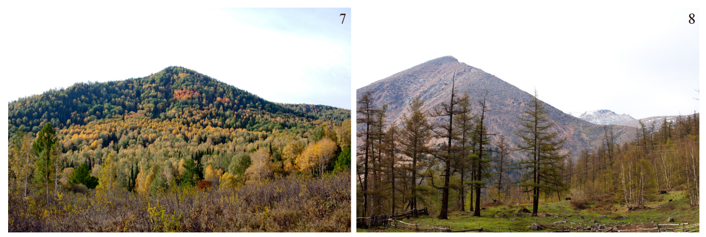
FIGURES 7-8. Xylena czernilai, collecting sites: 7) Tigireksky Ridge near Tigirek village; 8) East Sayan, near Mondy village.