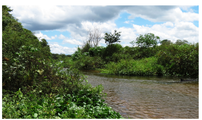
{\bf FIGURE~2.} Caatinga riparian vegetation, along the margins of Acaraú River, at the site of collection.

At Sanharão, we sighted at least five other individuals of T. teguixin , males, females and juveniles. We were able to identify the sex of adults because adult males have swollen gular regions and wider necks than females (Ávila-Pires 1995). We also sighted several individuals of T. teguixin in two other areas in Groaíras municipality: one was a sandy area situated on the left bank of the Acaraú River (Marrecas