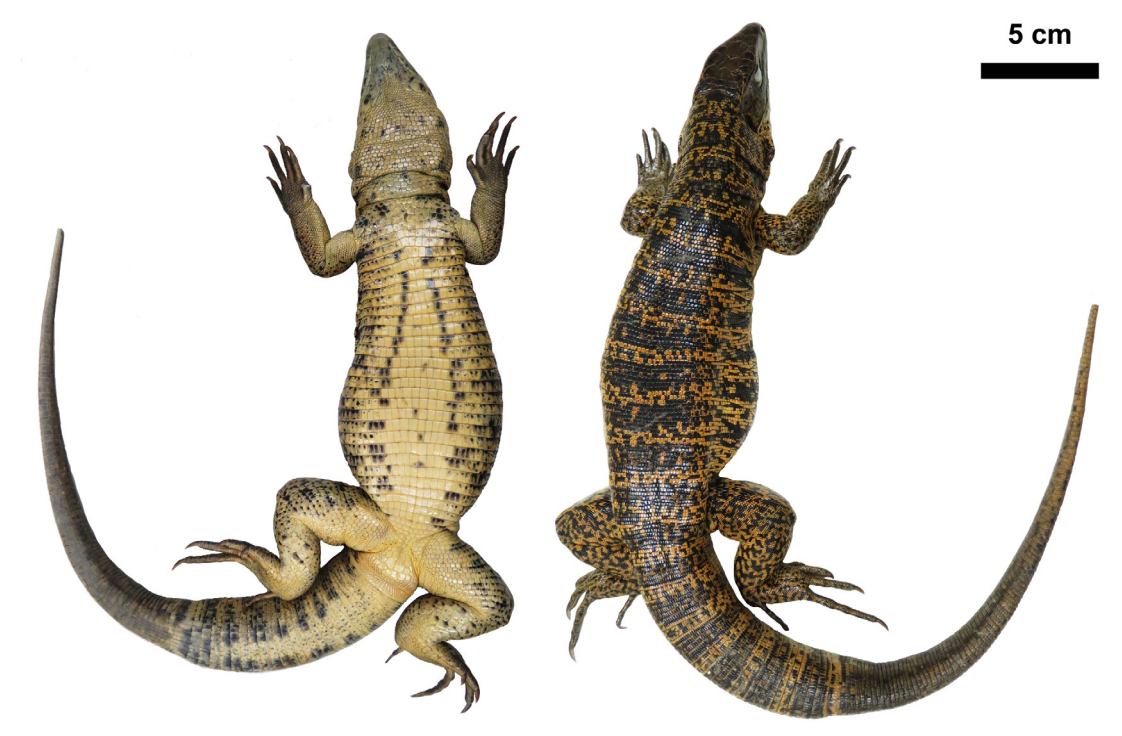
FIGURE 3. Ventral and dorsal view of adult female specimen of Tupinambis teguixin (SVL = 266 mm; CHUFC L 4848), illustrating the typical color pattern of the population occurring in the study area.

approximately 215 km E from the nearest previously recorded locality (Barras municipality, Piauí state; Benício and Fonseca in press ). Furthermore, this is the first report of T. teguixin from the semi-arid Caatinga biome; until now it was known in Brazil only from the Amazon Forest and Cerrado biomes (Figure 4). Our findings expand the knowledge of the Caatinga herpetofauna, reinforcing the deficiency of information from several areas and the need of additional surveys in unexplored regions in this biome.