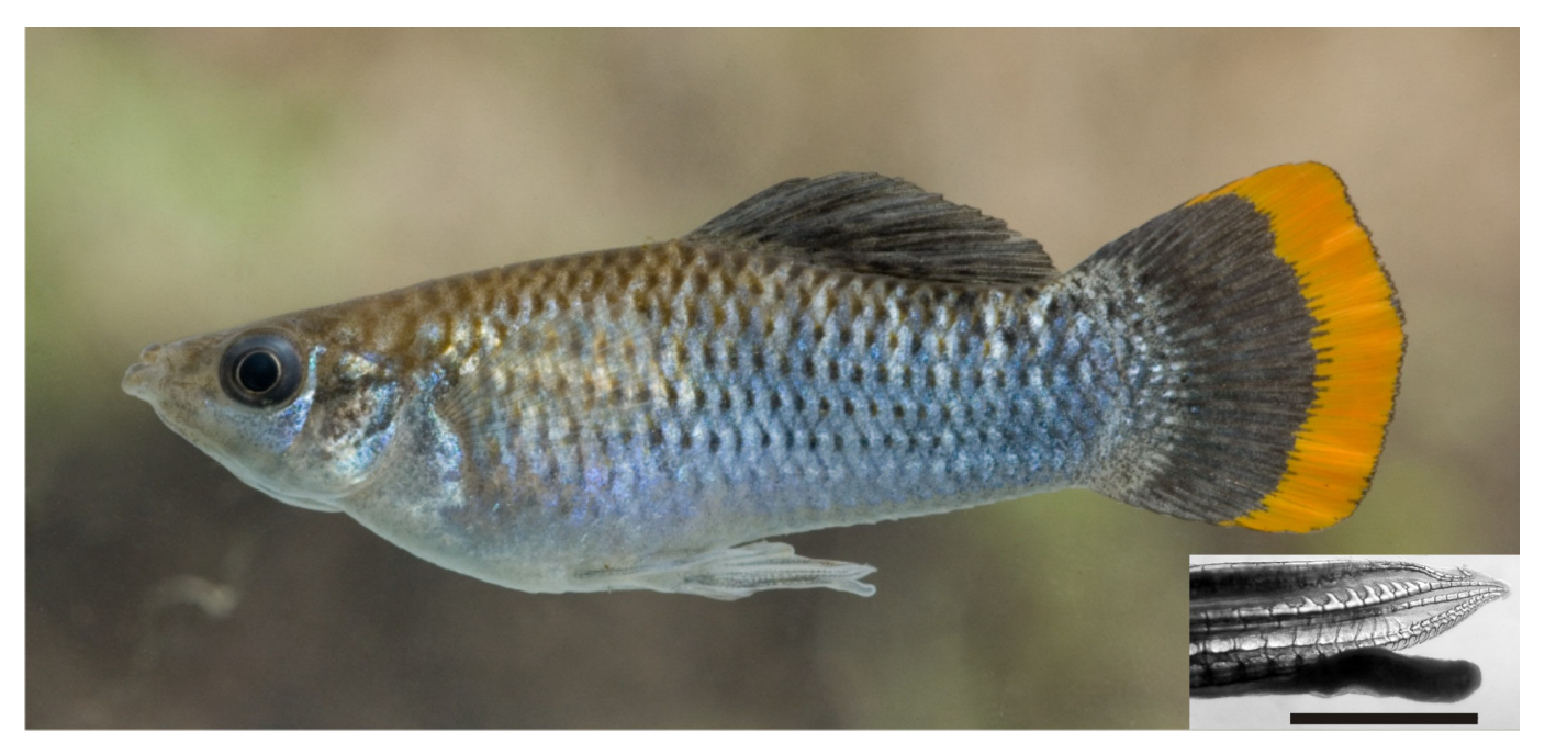
FIGURE 1. Adult male of non-native Poecilia sphenops (31.8 mm SL) and tip of the modified anal-fin (gonopodium). Scale bar = 1 mm.

appearance, some species are important in the aquarium trade (Axelrod et al. 2007), where, in Brazil, the most common species being the guppy ( Poecilia reticulata Peters, 1859); the black molly (melanic variety of Poecilia sphenops ); the swordtail ( Xiphophorus helleri Hekel, 1848); the platyfish [ X. maculatus (Günther, 1866)]; the variable platyfish [ X. variatus (Meek, 1904)], and the sail-fin mollies [ P. velifera (Regan, 1914), and P. latipinna (Lesueur, 1821)] (Alves et al. 2007; Magalhães and Jacobi 2008). In addition to the aquarium trade, it is not uncommon for some species to be used as biological controls of mosquitoes such as P. reticulata (Sherley 2000; Chandra et al. 2008).