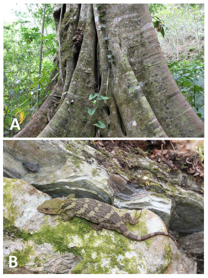
FIGURE 3. A) A previously unknown microhabitat type for Xenosaurus newmanorum (tree crevices) at the Casas Viejas locality. B) Female X. newmanorum SVL 132 mm encountered at Casas Viejas.

Finally, the third sampling took place on 26 April 2013 at 18:00 h at Casas Viejas in the same municipality (21°16'09"N, 99°00'09"W, 880 m elevation), located 10 airline km to the southeast of the nearest known locality in the Municipality of Xilitla, San Luis Potosí (Figure 1). We encountered 13 individuals, of which we also collected only a single subadult male specimen (CIB-4298). The observed individuals were found in a shaded coffee grove surrounded by subtropical forest, also near a dry riverbed (Figure 2B). Mean SVL was 111.4 ± 3.9 mm (82-132 mm) and mean tail length was 101.3 \pm 3.6 \text{ mm} (76-121 mm). We found the individuals in shaded microhabitats with a mean ambient temperature of 24.5 \pm 0.6 °C (21.1-28.5°C) and a mean microhabitat temperature of 23.0 \pm 0.4 °C (21.0-26.0°C). Mean cloacal temperature was 24.8 ± 0.3°C (23.5-27.0°C). We found ten individuals in rock crevices,