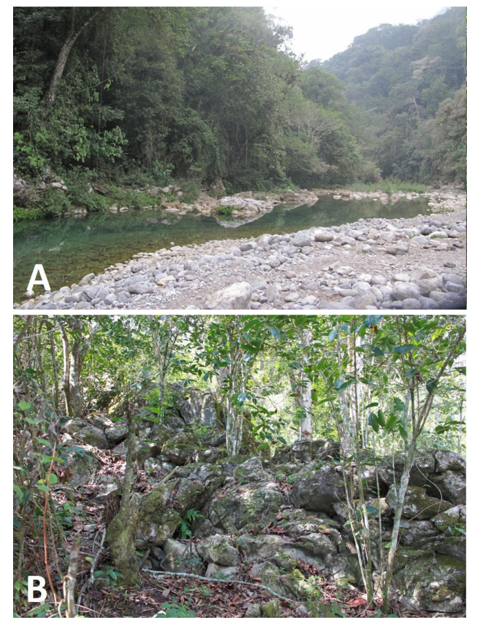
FIGURE 2. A) Subtropical forest at Plan de Zapotal. B) Shaded coffee grove at Casas Viejas.

We performed the second sampling on 24 March 2013 at La Gargantilla (21°14′57″N, 98°57′39″W, 825 m elevation) in the same municipality in a shaded coffee grove surrounded by subtropical forest, located 13.6 airline km to the southeast from the nearest locality