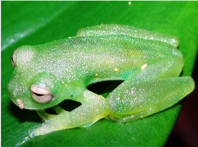
FIGURE 2. Dorsolateral view of Teratohyla midas, adult male (18.3 mm SVL) from farm El Ceilan, municipality of Florencia, department Caquetá, Colombia.