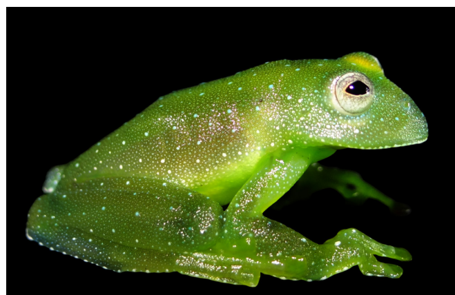
FIGURE 1. Lateral view of Cochranella resplendens , adult male (26.38 mm SVL) from Microcuenca La Resaca, municipality of Belén de los Andaquíes, department Caquetá, Colombia.

This frog was captured during the night, perching on the leaves around 0.5 m above the water of a fast-flowing stream in a secondary forest. The individual is an adult male with 26.38 mm SVL (snout-vent length) exhibiting all the diagnostic characteristics described by Lynch and Duellman (1973), including: prevomerine teeth, green bones in life, white parietal and visceral peritoneum, color in life dark green with white to bluish green flecks, round snout in dorsal view and gradually inclined anteroventrally