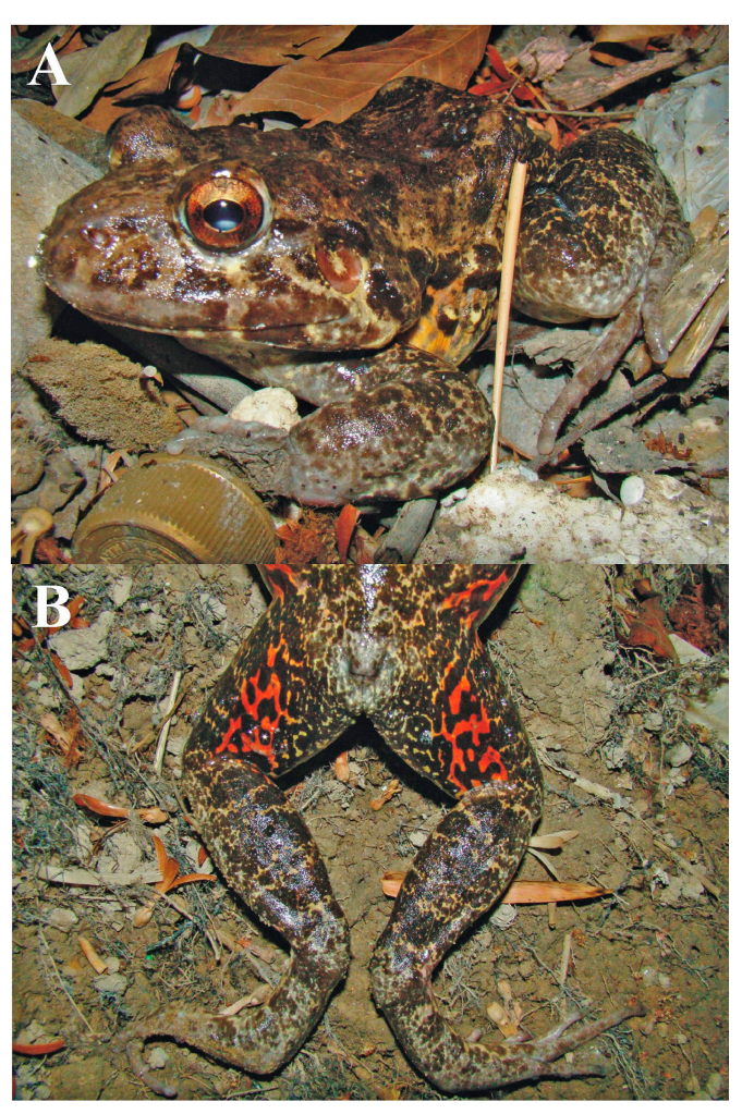
FIGURE 1. Adult male of Leptodactylus labyrinthicus (A) from Manaus, Amazonas, Brazil (INPA-H 28644) and detail of posterior thigh of the same specimen (B).

personal communication). The city of Manaus has grown significantly in recent decades, and many areas potentially suitable for breeding sites of amphibians have been