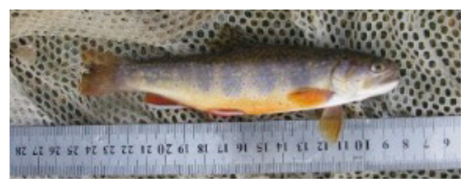
\begin{tabular}{ll} \textbf{FIGURE 2.} One specimen of $\it Salvelinus fontinalis (Mitchill, 1814), captured in Huaytire river. \end{tabular}

The presence of Salvelinus fontinalis in the southern part of the Peruvian Andes is undeniable, and the species – as suggested by Vila et al. (2007) – is possibly distributed throughout the region adjacent to the endorheic basin of Lake Titicaca. According to historical information, Salvelinus fontinalis (among other Salmonid species) was introduced to the region, and its current presence corresponds to isolated populations with few individuals due to its low quality as a focal species for Aquaculture Programs (compared to the Rainbow Trout) and the high fishing pressure experienced by Salmonids in the lotic environments of the high Andes.