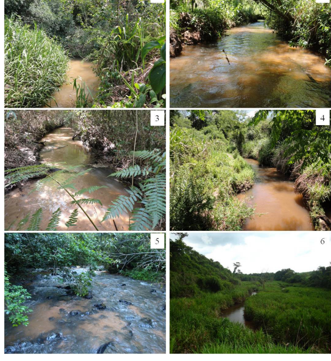
FIGURE 2. Examples of sampled localities in Rebio das Perobas, Ivaí and Piquiri River basins, Paraná, Brazil. 1) Concórdia Stream upstream; 2) Concórdia Stream downstream; 3) Saquarema River; 4) Mouro River; 5) Índios River upstream; 6) Índios River downstream.

Of the total species collected, only four were common to all the sampling reaches: Astyanax altiparanae Garutti