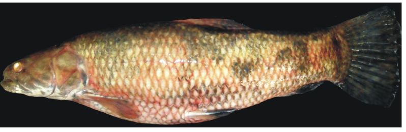
Hoplias malabaricus (Bloch, 1794) TL 250mm