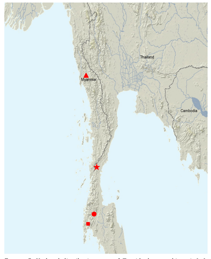
FIGURE 3. Updated distribution map of Tropidophorus robinsoni : (\star) , type locality "Tasan, Chumpon Province" (=Tasan, Chumphon Province, Thailand); ( \blacksquare ), Khao Lak, Phang-nga Province (Thailand); ( \bigcirc ), Khlong Saeng Wildlife Sanctuary (Surat Thani Province, Thailand); and ( \blacktriangle ), Tanintharyi Division (Myanmar).

FIGURE 2. Dorsal (A), lateral (B), and ventral (C) head views of an adult female Tropidophorus robinsoni (THNHM 17962) from Khlong Saeng Wildlife Sanctuary, Surat Thani Province, southern Thailand. Scale bar indicates 10 mm.