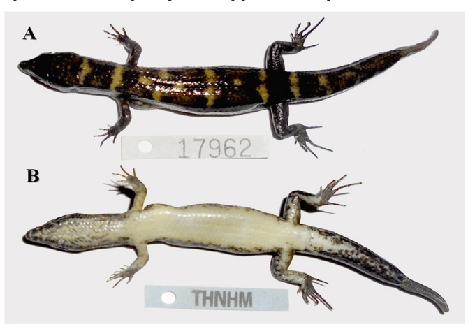
FIGURE 1. Dorsal (A) and ventral (B) views of an adult female Tropidophorus robinsoni (THNHM 17962) from Khlong Saeng Wildlife Sanctuary, Surat Thani province, southern Thailand.

Tropidophorus robinsoni was previously known only from the type locality "Tasan, W. of Chumphon, P. Siam" (Smith, 1919), Khao Lak in Phang-nga Province, Thailand (Pauwels et al. 2000) and from Tanintharyi Division in Myanmar (Wogan et al. 2008). The new locality thus represents the first provincial record for Surat Thani Province (southern Thailand), the fourth locality for the species, and it partly fills approximately 200 km hiatus