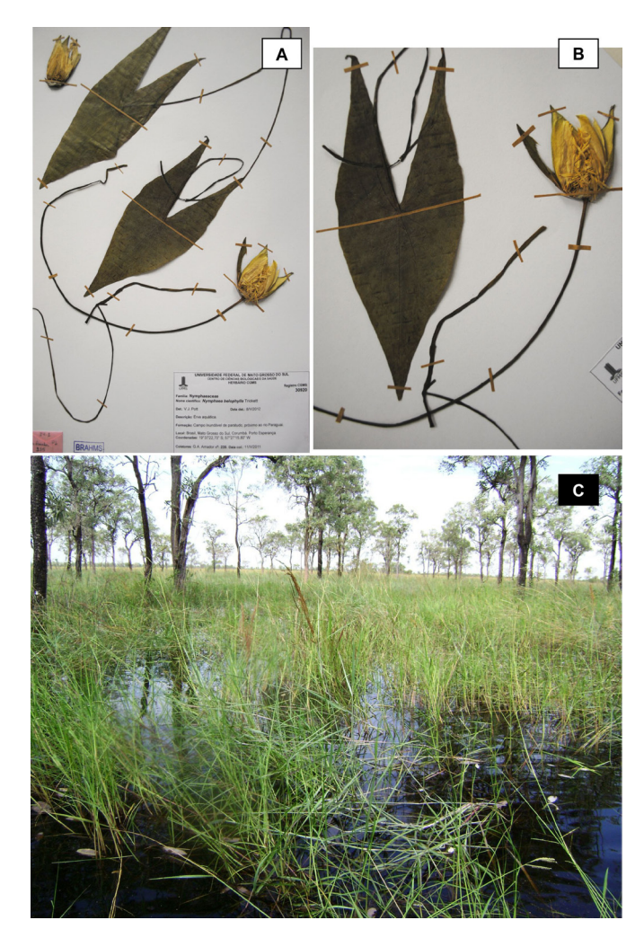
FIGURE 1. A - Nymphaea belophylla specimen n. 30920, kept in Herbarium CGMS, collected in the Pantanal wetland at Porto Esperança, Corumbá, Mato Grosso do Sul, Brazil. B – Detail of leaf and flower. C – Plant habitat in the floodable savanna.

on the apex with 20 cm long, to 7 cm wide, with acicular sclereides; flowers with sepals and petals in distinct whorls of four; sepals ca. 5-6 cm long and 2 cm wide, green, oblong-ovate; petals shorter than sepals, the inner ca. 2.6-3.2 cm long and 1.3-1.8 cm wide, creamy and light yellow; the outermost stamens ca. 3.0 cm long, creamy and light yellow; carpelar appendices ca. 1.3 cm long, cream-colored to light yellow. The collected specimens were kept in the Herbarium CGMS (UFMS) under the record numbers CGMS-30919 (G.A. Amador 234) and CGMS-30920 (G.A. Amador 235). New collection records are necessary for better characterization and documentation of N. belophylla .