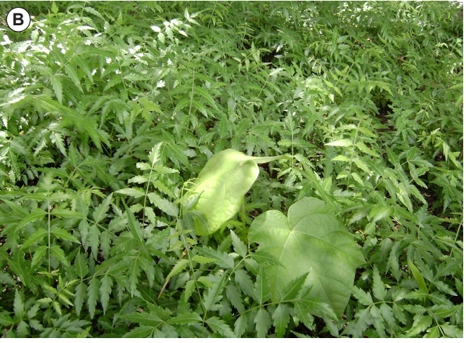
FIGURE 1. Spontaneous seedlings of Azadirachta indica growing under parental trees in 2007, in the surroundings of Cocó Ecological Park, Fortaleza, Ceará, NE Brazil. The large leaved seedling in B is a native species, which has now to compete with hundreds of A. indica seedlings when trying to grow.