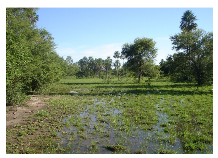
FIGURE 2. Temporary pond surrounded by pasture and Chacoan vegetation, at the Patolá farm, which represents the general aspect of the two temporary ponds where the juveniles of L. asper were collected.

Federal de Mato Grosso do Sul (acronym ZUFMS), Campo Grande, Brazil. This is the first record of L. asper for Brazil, which extends the species distribution ca. 73 km northeast from Puerto Casado, Alto Paraguay Departament, Paraguay (22°18′0.00″S, 57°58′0.00″W; Figure 3). Two individuals (ZUFMS 02640 and ZUFMS 02641) were collected in pond 1 at 20:15 h. Both were found underwater at about 10 cm deep in contact with the bottom. The area of pond 1 was 1347 m², water temperature was 30.7° C, air temperature was 27.3° C, and the relative air humidity was 69%. Both individuals were juvenile, with SVL (snout vent length) of 37.05 mm and 37.85 mm. The other two individuals (ZUFMS 02638 and ZUFMS 02639) were collected in pond 2 at 20:50 h, also underwater at about 10 cm deep in contact with the bottom. The area of pond 2 was 1643 m²,