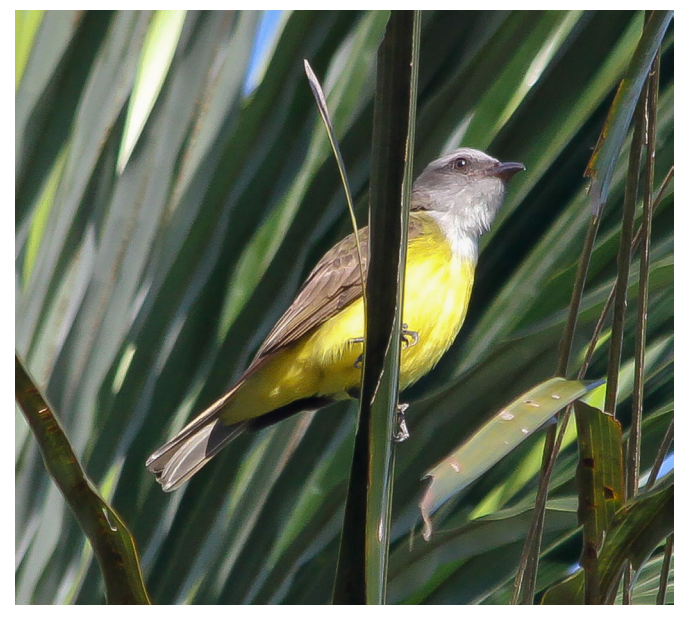
FIGURE 3. Tyrannopsis sulphurea photographed in the gallery forests of the Correntes River, State of Mato Grosso do Sul, Brazil.

of the state. There is very strong agricultural development in these regions, leading to increasing pressures on remaining forests. Thus, there is a need for further studies in order to fulfill gaps on distribution of these species in the state, as well as to indicate priority areas for conservation.