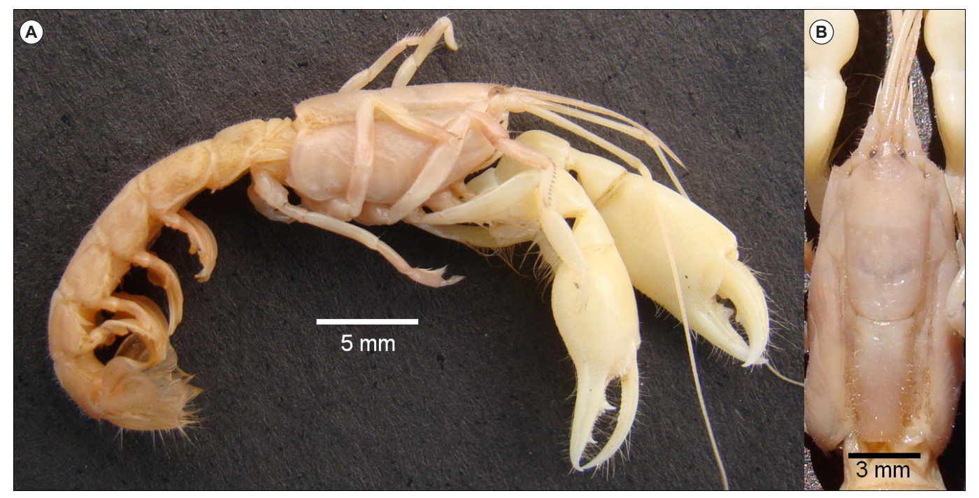
FIGURE 1. Axianassa australis Rodrigues and Shimizu, 1992: male collected in the estuary of Real River, state of Sergipe, Brazil (NEP-CRUST 0004). (a) Lateral view of whole specimen; (b) dorsal view of carapace.

On July 2010, one individual of A. australis [male with 3.5 mm in carapace length (CL)] was caught with a PVC corer (10 cm of diameter and inserted 20 cm depth into