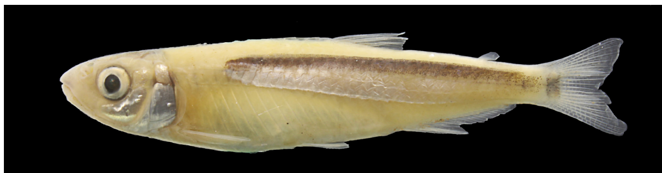
FIGURE 1. Lateral view of Engraulisoma taeniatum , UFRO-I 12233, 38.6 mm SL, collected at the mouth of the igarapé Belmont, Porto Velho, Rondônia, Brazil.

During the development of the project Monitoramento e Conservação da Ictiofauna do rio Madeira (Assessment and Conservation of the ichthyofauna of the Madeira River) from 2009 to 2011, a total of 239 specimens of E. taeniatum were collected in seven tributaries of the rio Madeira in Rondônia and Amazonas States. The specimens were captured mostly with seine and were deposited in the Coleção Ictiológica da Universidade Federal de Rondônia