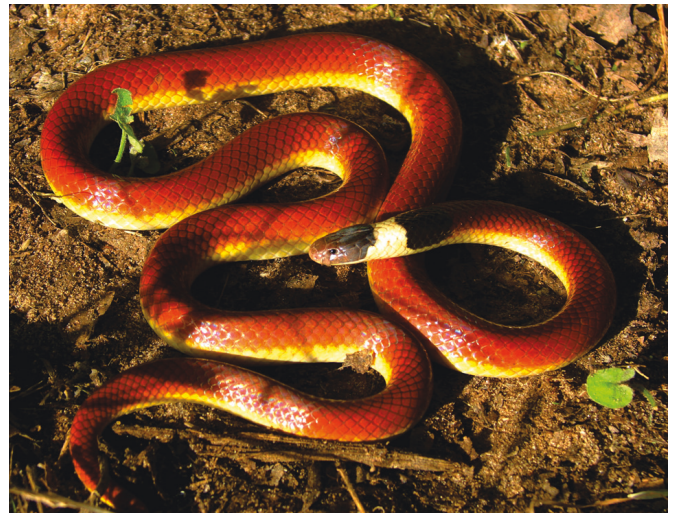
FIGURE 3. Phalotris sansebastiani . INALI 4342. Female from La Condorera, between San Francisco and crossroad of Pampichuela, Valle Grande, Jujuy.