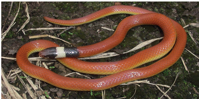
FIGURE 2. Phalotris sansebastiani . FML 15971. Female from Aguas Blancas – road to Finca Arazayal, Departamento Orán, Salta. 434 m a.s.l.

All other characters that separates both species are, in our material, as mentioned in Jansen and Köhler (2008).