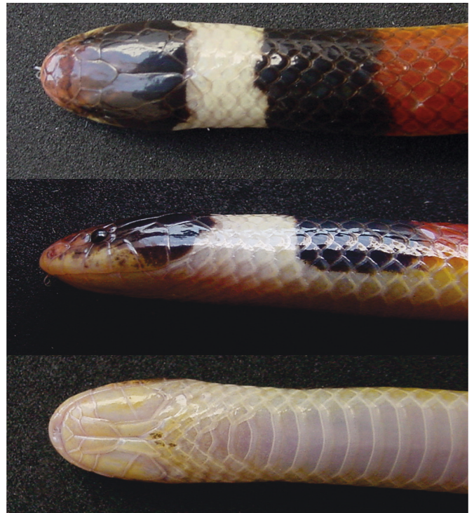
FIGURE 4. Phalotris sansebastiani . Details of the head of specimen FML 15971.