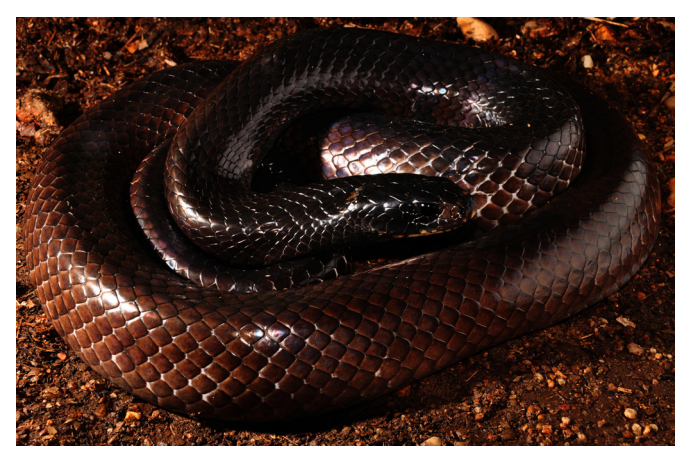
FIGURE 1. Adult male Hydrodynastes melanogigas collected in the municipality of Carolina, Maranhão.

Specimens were deposited at the herpetological collection of the Museu Paraense Emílio Goeldi (MPEG 24383 and 24384). This is the first record for the state of Maranhão and corresponds to the northernmost limit of this taxon, extending ca. 350 km N-NE from the municipality of Lajeado, Tocantins state (Figure 2) (Franco et al. 2007).