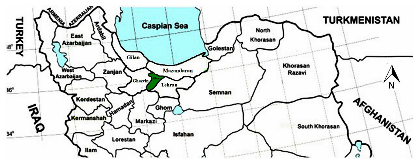
FIGURE 1. Iran- Alborz province, where the Cononedys bituberculata specimens have been collected.

Material for this study was collected from different habitats of the northern Iran using malaise traps during 2010. Samples were collected between March and November. The specimens were extracted from the malaise traps and sorted weekly. Specimens were dehydrated in 99.6% ethanol for 5-10 minutes and then placed in a pure solution of hexamethyldisilazane (HMDS) for15-20 minutes. The specimens finally placed in a glass plate for drying. The dried specimens were then labeled. Morphological terminology follows Greathead and Evenhuis (1997) and Zaitzev (1996). Description of female genitalia follows Lamas et al. (2002). Female genitalia preparations were made by macerating the apical portion of abdomen in cold 10% KOH for 14-15 hours, and then washed with distilled water and transferred to glycerin.