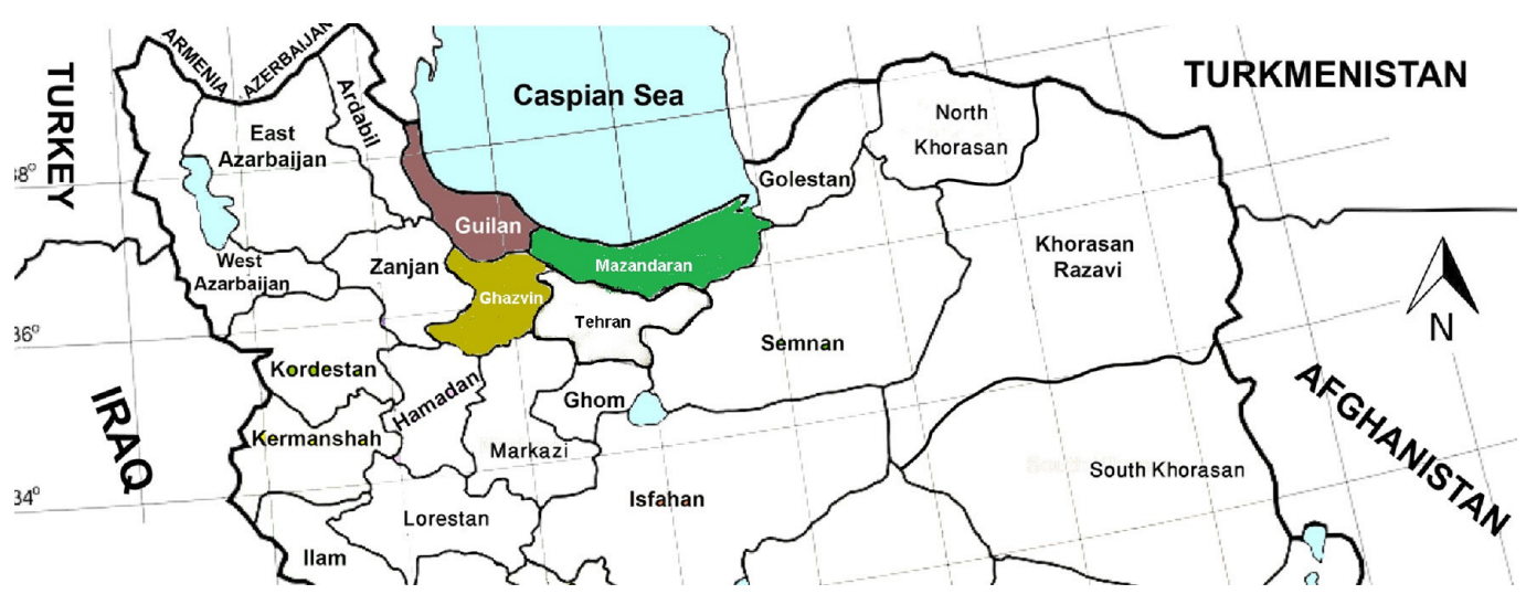
FIGURE 1. Iranian provinces where Dasysyrphus species were collected.

Synonyms: Dasysyrphus confusus (Egger, 1860), Scaeva