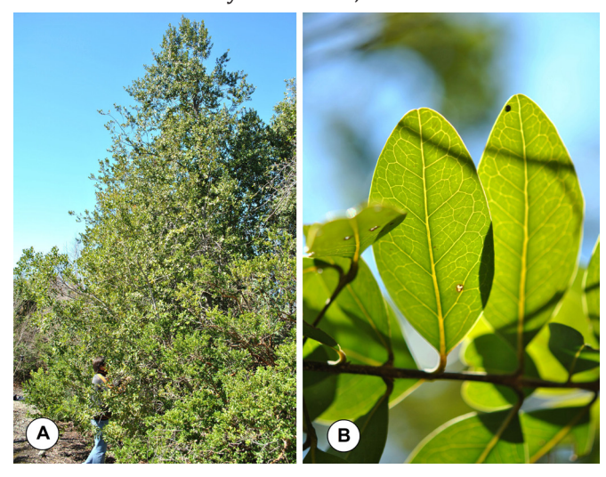
FIGURE 1. Mixed Wood with presence of individuals of Beilschmiedia berteroana (Gay) Kosterm. A) Adult individual. B) Detail of the leaves.

In the Maule Region there are five priority sites for the conservation of biodiversity, which are outlined under the national strategy for conservation and biodiversity (CONAMA 2003). Data collection and flower surveys were undertaken in Altos de Achibueno, located 33 km to the southwest of the city of Linares, in the foothills of the