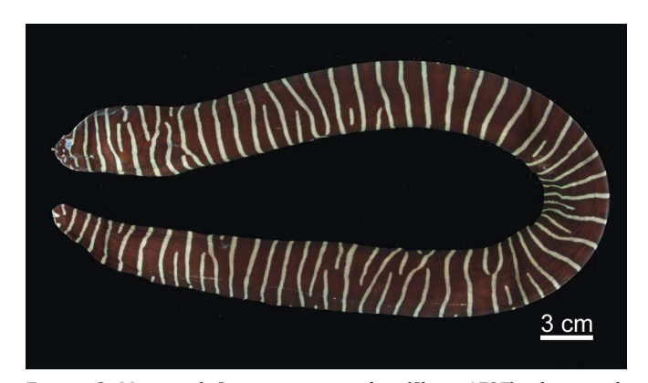
FIGURE 3. Moray eel Gymnomuraena zebra (Shaw, 1797), photograph of a dead specimen before fixation, collected from the same locality and habitat in Okinawa, Japan, as RUMF-ZN-00001, here identified as Baseodiscus mexicanus (Bürger, 1893). This specimen of G. zebra was dissected and processed during another study, and no voucher remains.

Baseodiscus mexicanus exhibits remarkable a resemblance to the zebra moray eel, Gymnomuraena zebra (Shaw in Shaw and Nodder, 1797) (Actinopterygii: Anguilliformes: Muraenidae) (Figure 3), possibly indicating a relationship of mimicry. Near Cape Manza in Okinawa, B. mexicanus and G. zebra occur in exactly the same habitat, with the latter species much more abundant (Uyeno, pers. obs.). The distributions of these two species broadly overlap; the moray eel is distributed from the Red Sea and eastern African coast to the Society Islands. north to the Ryukyu and Hawaiian Islands, and south to the Great Barrier Reef (Fricke 1999); it also occurs in the central eastern Pacific: along southern Baja California, Mexico; and from Guatemala to northern Colombia, including the Galapagos (McCosker and Rosenblatt 1995). Future investigations of the ecology and toxicology of these animals may shed light on a possible coevolutionary relationship between them.